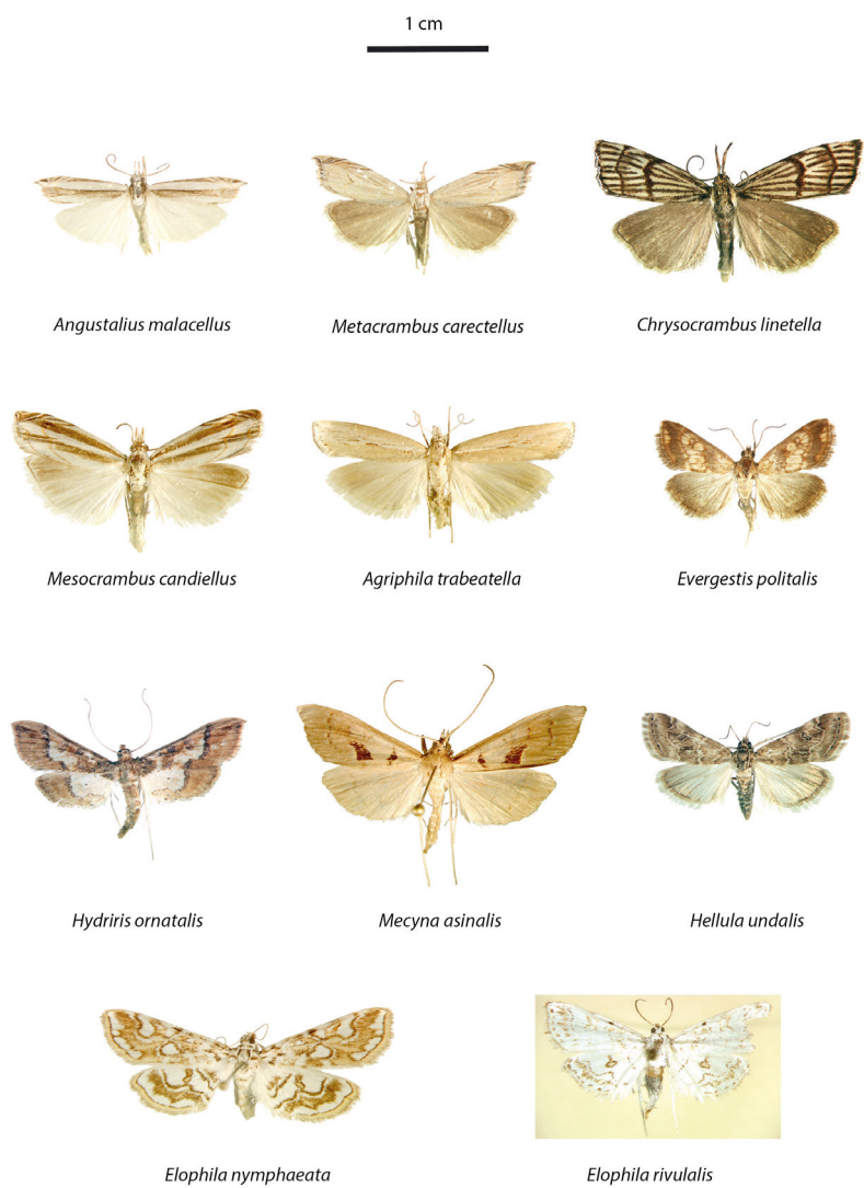
Tab. 2. Adults of Crambidae, Crambinae (from Angustalius to Agriphila), Evergestinae (Evergestis), Spilomelinae (Hydriris and Mecyna), Glaphyriinae (Hellula), and Acen-tropinae (Elophila) of the Salento.