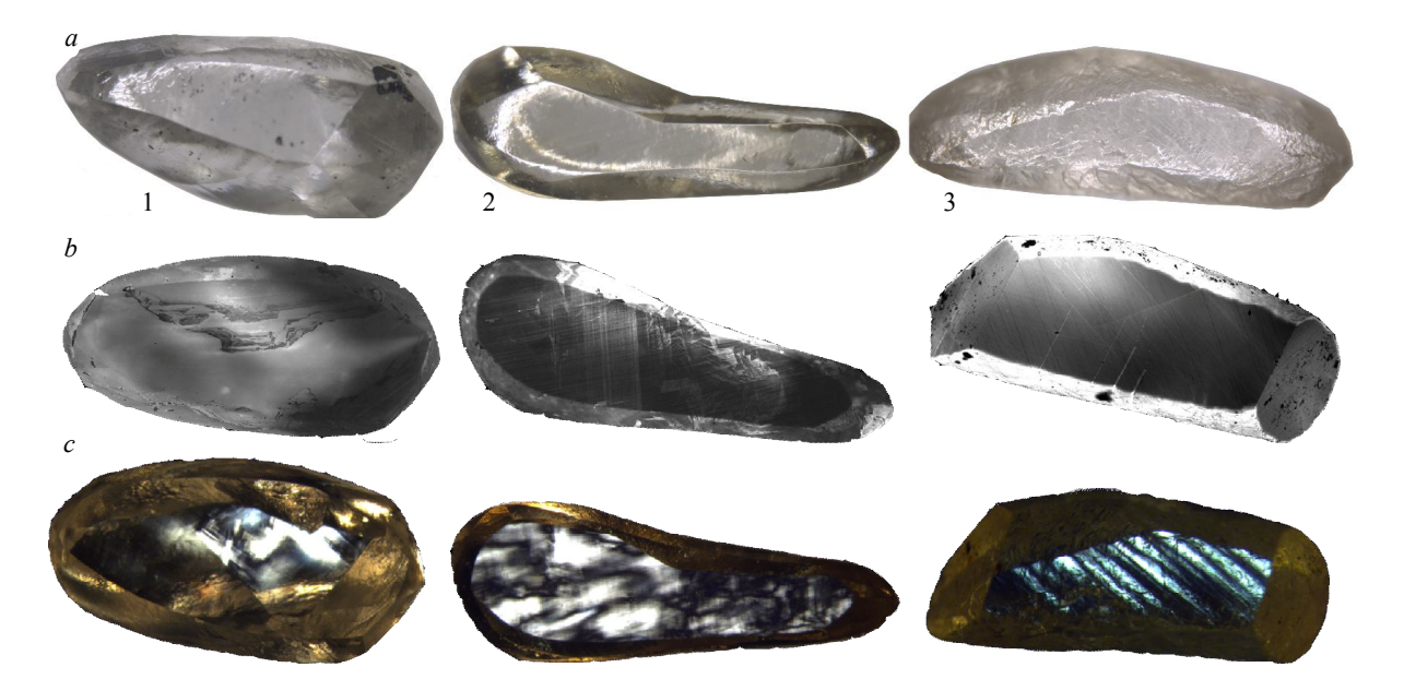
Fig.1. Images of the crystals under study: a - in reflected light; b - in cathodoluminescence; c - in transmitted light in crossed polarizers

Results and discussion. Fig.1, a shows images of the studied crystals in reflected light. All three crystals are strongly distorted dodecahedroids (according to the Ural type). The crystal edges are highly smoothed, with signs of natural mechanical polishing [7]. CL images (Fig.1, b ) of crystals 1 and 2 show that zoning is directed along the elongation. There are no closed zone contours, that could indicate that elongation formed during the crystal growth. Also, there is no transverse zoning typical for the crystals being the part of columnar aggregates. In the CL image of crystal 3 no growth zoning is observed. All features of sample 3 visible in the CL images are typical of diamond crystals with post-growth deformation [12, 17]. In anomalous birefringence, crystals 1 and 2 are characterized by a high level of residual stresses that do not allow visualization of their internal structure. In crystal 3, severe plastic deformation led to the appearance of a very contrasting zonal optical anisotropy along the {111} planes. Five systems of parallel lines (three light and two dark) are distinguished in the CL image of this crystal. There are three systems of slip planes {111}, caused by plastic deformation in diamond and marked by the luminescence of nitrogen-vacancy centres H3 [12, 13, 17]. Dark lines could be polishing defects. An additional indicator of internal stresses is the crystal destruction into three fragments during polishing.