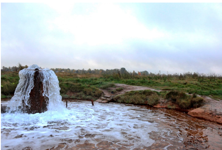
Fig.8. Flowing well from Middle Devonian aquifer near the spa town of Staraya Russa

There are many artistic works associated with the lake. The 19 th century Russian composer Nikolai Rimsky-Korsakov set much of the action for his famous opera «Sadko» in Novgorod and on the shores of Lake Il'men and in the legendary realm of the sea king. «Sadko in the underwater Kingdom» is a famous painting by Ilya Repin, the distinguished Russian artist.