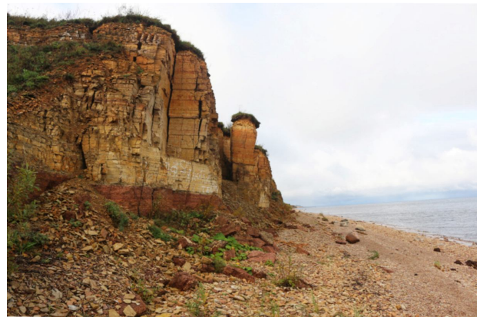
Fig.2. An exposure of the Buregskaya Formation on the shores of Lake Il'men. The cliff is 6-8metres high

area. Murchison had played a fundamental role in recognizing and establishing not only the Silurian System based on sequences in Wales and the Welsh Borderland, but also the Devonian system based on rocks in the county of Devon in south-west England. But at the time of his visit to Russia Murchison had a significant problem in establishing the Devonian as a separate system and which was proving very controversial. In Scotland there was clearly terrigenous Old Red Sandstone sediments with distinctive fossil fish, whereas in Devon there were limestones with brachiopods and corals that were somewhat intermediate between the comparable Silurian and Carboniferous faunas. Murchison had visited continental Europe in the summer of 1839 and importantly had met von Buch in Berlin and studied his collection of Russian fossils. These discussions and the fossil collection provided the impetus for Murchison to see the Russian sections for himself.