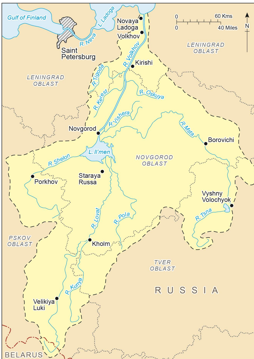
Fig.1. The River Volkhov-Lake Il'men drainage basin (after A.F.Safronov)

post-glacial deposits. The Quaternary complex is represented by upper Pleistocene sediment, of glacial, glaciolacustrine and glaciofluvial origin, and Holocene deposits derived from lakes, rivers and marshes.