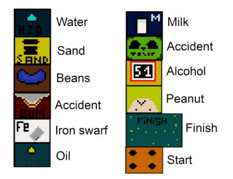
Fig. 3. Representation and meaning of every square on the board.