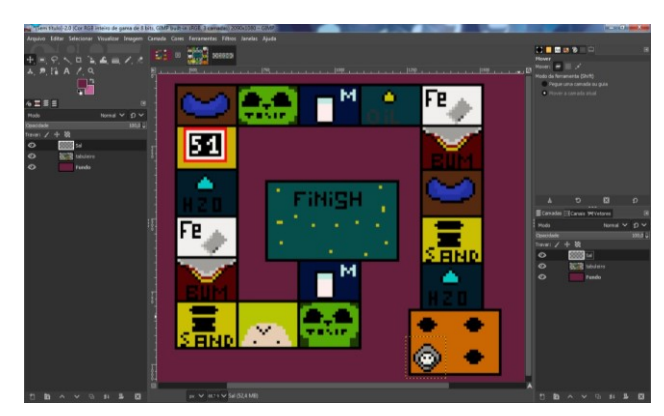
Fig. 2. Board built by Unity.