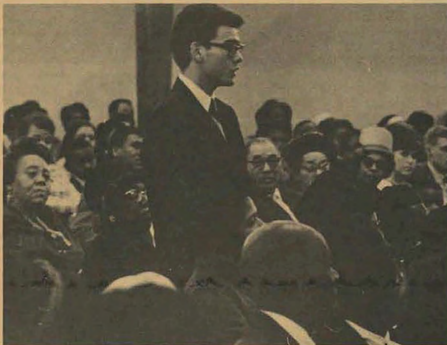
12 A feature of the Race Relations Workshop was the question-and-answer period involving persons in the audience.

Chattel slavery considers the individual's person as property, while an indentured servant's labor was the only property owned by the master. We still see vestiges of it today, or what we hope are the last vestiges of it. But this is literally true. This is what happened, and how it came about. The doctrine and the dogma of which we talk — of white supremacy or differences between races—was largely fabricated in the last 200 years as an excuse to justify slavery; this is historical. You can go back a couple of hundred years and you don't find people talking about Negro inferiority much before the Revolutionary War period. In fact, when the ideas of freedom first began to be talked about in America, they felt that everybody was assimilable into American so-