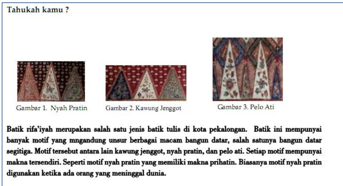
Figure 2. Knowledge of Rifa'iyah Batik

The main topics and sub-topics are written in the LKS. In addition, LKS also contains basic competencies, indicators, learning objectives, and learning instructions.