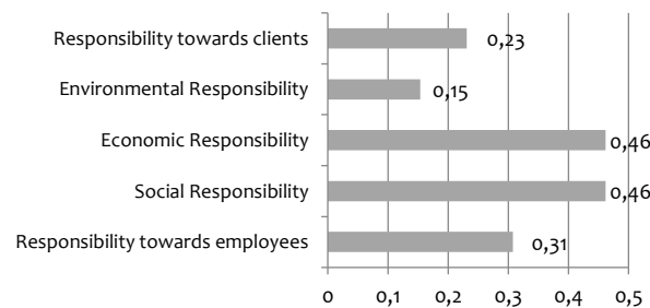
Figure 1: Companies' focus on CSR dimensions

As shown in Fig. 1, the economic and social dimension has been placed at the top of companies' responsibilities. The economic dimension has gained a great attention of all companies in different context. The studied literature agreed on the importance of mandatory activities that companies should take during the crisis on behalf of their shareholders and in order to restart their activities (García-Sánchez, & García-Sánchez, 2020). In addition, all types of companies prioritize the need for economic sustainability in the post-pandemic period. Unlike the environmental responsibility that declined in importance during the pandemic as well as over the longer term in the post-pandemic era, companies, regardless of years working with sustainability, reduced their environmental priorities during the Covid-19 outbreak but increased their social priorities (Zhang et al., 2020; Barreiro-Gen et al., 2020; Zhang et al., 2021).