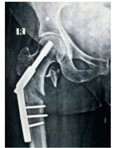
Figure 2: Collapse in a case treated with DHS