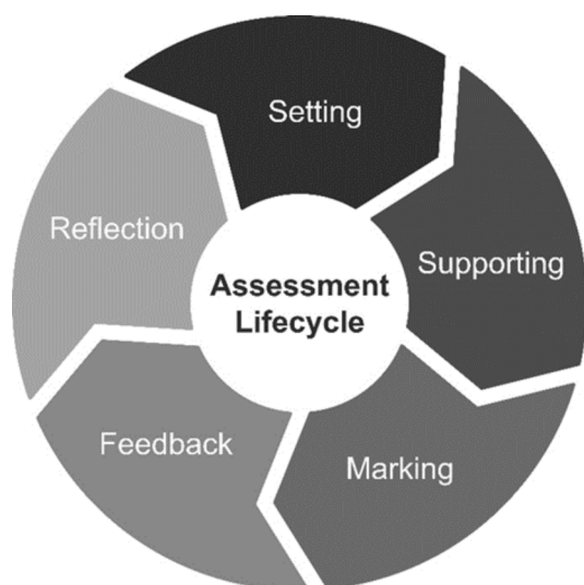
Figure 1 Simplified assessment lifecycle (adapted by Ben Davies and Stephen Powell from Forsyth et al., 2015)

We designed the assessment life cycle to provide a framework for looking at each task as an activity which had been selected by teaching staff to be the best fit to the module learning outcomes, rather than as a generic process which needed to fit into a set of existing procedures. It focuses attention on the task as a whole, with numerous people contributing to its successful outcomes and discussing this together. The intention was that it was also pedagogically neutral, to allow discussion of processes and requirements that were consistent across any method, size, or level of assessment.