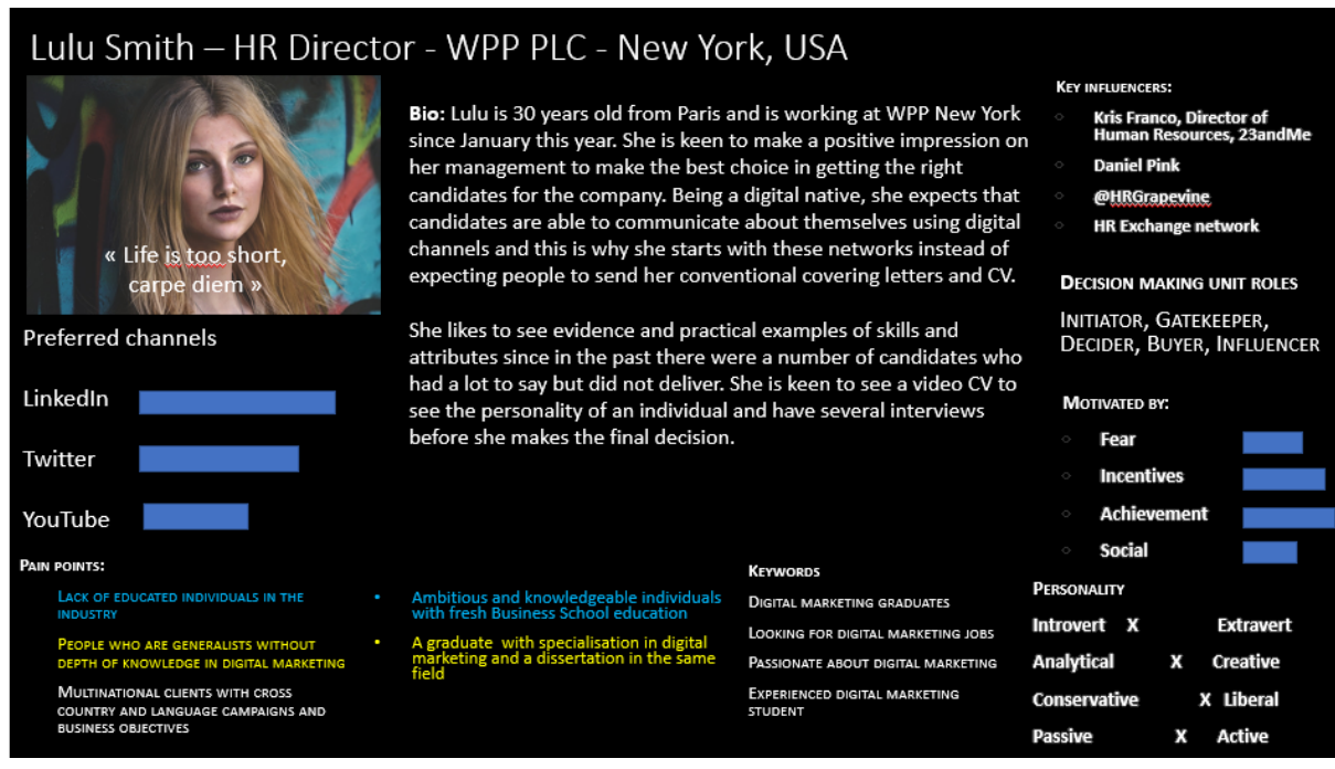
Figure 1. An example buyer persona.

There are several ways to develop a buyer persona using a data-driven strategy. The data-driven process uses real data to understand the pain points and corresponding hot points or trust points of the buyer persona. Data from surveys and publicly available data can be used to develop the profile. Social media is also a critical source in order to understand the customer. For the social media marketer, interacting with customers is generally a very regular occurrence, and this participation is critical to developing buyer personas. A key aspect of ethnography is participant observation and interaction with people. Digital ethnography is therefore particularly suited to engaging with an audience and for observing, understanding, formulating, and refining buyer personas.