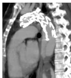
Figure 1 CTA reconstruction at 1 year of FU showed a new tear at the distal portion of the stentgraft with an insinuation of it into the false lumen

She was discharged one week later with no symptoms. During follow-up, the 12 months CTA reveled a new tear at the distal portion of the stentgraft with a significant insinuation of this one into the false lumen and a proximal progression of the later (figure 1).