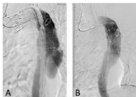
Figure 2 A - Angiographic images before the relining of the previous endograft with a Medtronic Valiant 26*100 mm thoracic distal component stent graft with a distal landing zone above the celiac artery; B - Final angiographic image

false lumen reperfusion, which was completely occluded in the thoracic segment. The CTA performed one month after confirmed adequate relining of the graft and complete thrombosis of the false lumen in the thoracic aorta (figure 3). The last performed CTA was at 2 years follow-up and showed imagiological stability and thrombosis of false lumen at the thoracic aorta level.