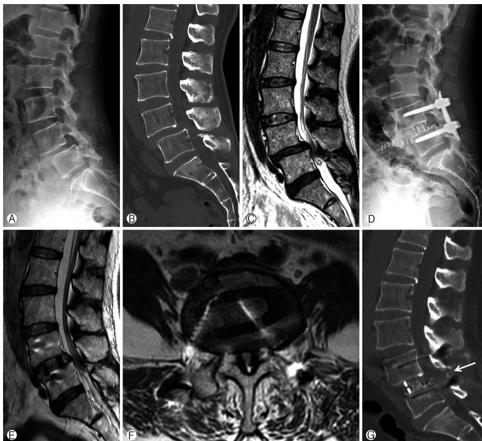
Fig. 3. Preoperative A simple lateral radiograph, B mid-sagittal view of CT, C T2-weighted sagittal MRI of the lumbar spine. Spondylolisthesis with severe spinal canal stenosis at L4-5 are shown. D Immediate postoperative simple lateral radiograph. Improved disc height, but partial reduction of the L4-5 spondylolisthesis was noted. Postoperative 6-month follow-up E T2-weighted sagittal, and F axial MRI showed still remaining stenosis. G CT sagittal image taken after the second operation. Partial laminectomy site was seen (white arrow).

There was 1 patient who required a revision surgery. Her initial symptoms, which were pain in the back and left leg and grade 4 motor weakness in ankle dorsiflexion, improved somewhat after the initial operation (Fig. 3A-D). However, she complained that the amount of pain relief was not satisfactory. In addition, the motor weakness status remained similar to the preoperative status. At 6 months postoperatively, we performed additive posterior decompression surgery (Fig. 3E-G). The leg