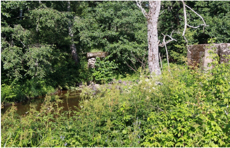
Fig. 2. Fragments of the Khabolovka River hydroelectric power station abutments.

In the 30s of the 20th century during construction of Ruchy naval base, Luzhlag prisoners created railway embankments and bridge crossings over Khabolovka in its lower reaches. Apparently at the same time a stone and concrete hydropower plant dam was built at the site of the mill dam near the village of Koskolovo, and a bend in the river was straightened in its downstream end during the construction of the discharge channel. In 1941, the dam was blown up by retreating Red Army units. At present the waterworks are completely destroyed. A general view of the fragments of the abutments is shown in Figure 2.