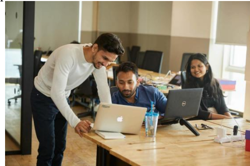
Figure 3. ByteStyle is fundamental to corporate culture at ByteDance and represents the principles we uphold as employees [6].

weakening the hierarchical title, and keeps the Objectives and Key Results of the company management open to subordinates, making the company more open, equal and transparent.