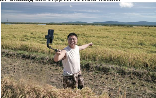
Figure 5. The short video records the beautiful countryside, and also allows more people to see the good scenery and high-quality mountain goods in the village [8].

Byte launched the "Byte Rural Plan" to promote sustainable rural development. Among them, the "Village Guardian" program brought 3.678 billion precise exposures to 934 villages, making many villages a popular check-in place. In addition, Douyin e-commerce has driven 1.793 million agricultural special products to be sold across the country, and Douyin's three rural-related videos are played more than 4.2 billion times a day on average. This move has effectively optimized the marketing path of agricultural special products and rural cultural tourism content consumption, and has contributed to the training and support of rural talents.