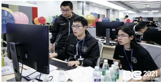
Figure 2. 2021 BYTE CAMP competition scene [4].

Through the Chinese campus activity website, the research learned that ByteDance has an offline scholarship program worth 100,000 scientific research bonuses, which is aimed at the mainland [3].