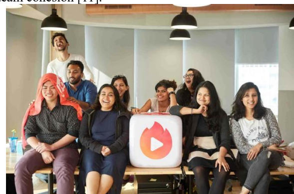
Figure 6. Good team cohesion [12].

Through knowledge management of online software and offline activities, ByteDance has inspired employees to study after work, improved their professional knowledge and overall quality, and improved the relationship with employees through communication and collaboration with departments. The tacit understanding improves the transparency of internal resources and the circulation of internal information, enhances the work efficiency of employees, and improves the trust of employees in the byte team. When team trust is high, team satisfaction, team efficiency and cohesion can be improved [10]. Improve employee and team creativity through a positive organizational learning culture, leadership development, and team development, which is positively correlated with team cohesion [11].