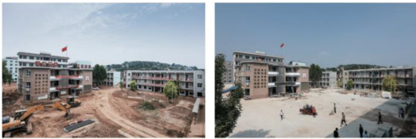
Figure 4. Left: Before the renovation of the No. 1 Junior High School in Kangdian Town, Gongyi City, Henan Province. / Right: After repair [7].

ByteDance launched a digital public welfare platform in 2021. By showing the public welfare scene, it has inspired more people to participate in public welfare undertakings. As of February 2022, ByteDance Public Welfare has already 216 public welfare organizations launched 154 public welfare projects, and a total of 3.45 million people raised donations. Not only that, ByteDance uses technology to solve practical problems, and helps separated families find lost people through technical positioning.