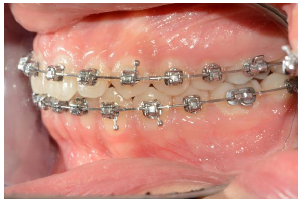
Figure 1. Nonextraction treatment with the Damon bracket system.

a minimum of 5-mm maxillary and mandibular tooth size arch length discrepancies according to Hayes-Nance analysis, absence of systemic diseases, absence of missing permanent teeth or congenitally absent teeth, absence of prior orthodontic treatment, and not using any additional appliance (miniscrew, Herbst appliance, lip bumper appliance, headgear, or distalization device), during the treatment, using the Damon Q bracket system (Ormco, California, USA) (0.022-inch bracket slot size) and bonding brackets in the upper and lower arches to the level of seventh teeth (Figure 1), finishing the treatment by performing dental levelling and alignment with 0.19"x0.25" stainless steel archwires.