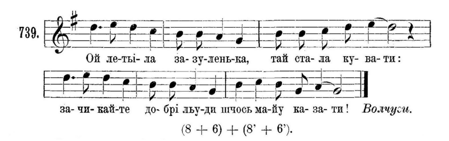
Figure 4: Song with a kolomyika verse with two caesuras.

It is also necessary to emphasize Lyudkevych's subtle feeling of the rhythmic song structure and its natural caesura. So, for example, singing epic songs with a kolomyika verse (the compiler placed them at the beginning of the II part of the collection), are shown mainly with two (4/4/6), and even one caesura (8/6), as they are sung by people – in a free parlando style (see nos. 739 and 748 etc.). In the dance kolomyikas , each fourteen-syllable syntagm is divided into three caesuras as required by the rhythm of the melody.