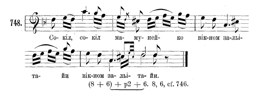
Figure 5: Song with a kolomyika verse with one caesura.

In the introductory article, the compiler also drew attention to the notation of the intonation-system structure of folk songs. He recommended starting from the tone scale that actually appears in the folk song and, accordingly, to put down key signs. Stanyslav Lyudkevych also defended the accurate record of the tempo and absolute pitch of the song in which it was performed by the singer.