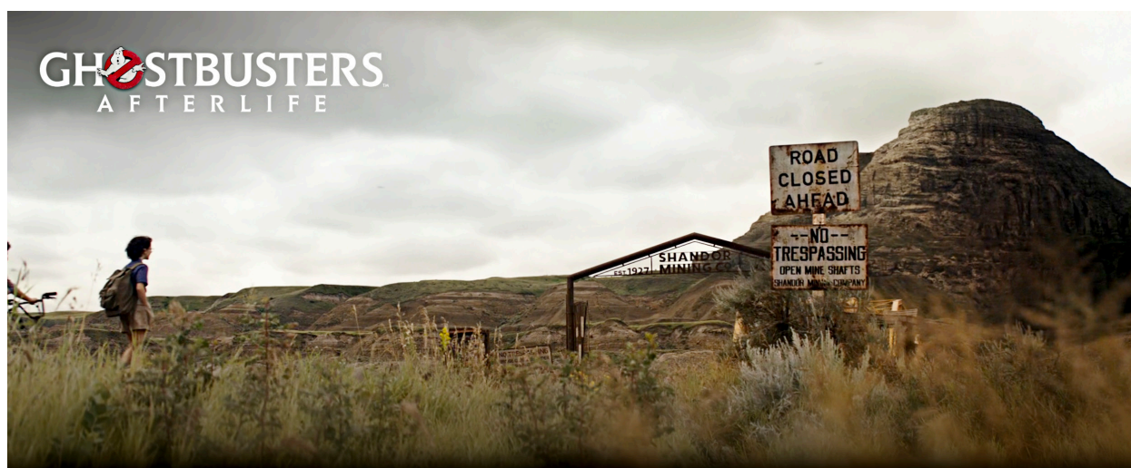
Figure 4. Defunct mine owned by the occultist Ivo Shandor

While the diegetic setting of Afterlife is Oklahoma, primary filming took place in the Canadian province of Alberta. Such visual leg-erdemain invites scholars of the (Geo)Humanities to bring the real and imagined landscape into the frame of analysis. Apropos of our discussion of Oklahoma as a focal point of US hydrocarbon production, Alberta's Athabasca oil sands rank as the fourth-largest reserve in the world, behind Venezuela, Saudi Arabia, and Iran. An extremely 'dirty' practice, tar sands production produces triple the global-warming pollution when compared to conventional crude. Its impact on the surrounding landscape and local ecosystems are also acute, as a 'hugely expensive energy- and water-intensive endeavour that involves strip mining giant swaths of land and creating loads of toxic waste and air and water pollution' (Denchak 2015). Afterlife's evocative use of landscape speaks to these issues. The elder Spengler grandchild Trevor lands a summer job at the local drive-in, itself a visual manifestation of the American car culture/petroculture, which has dramatically contributed to global