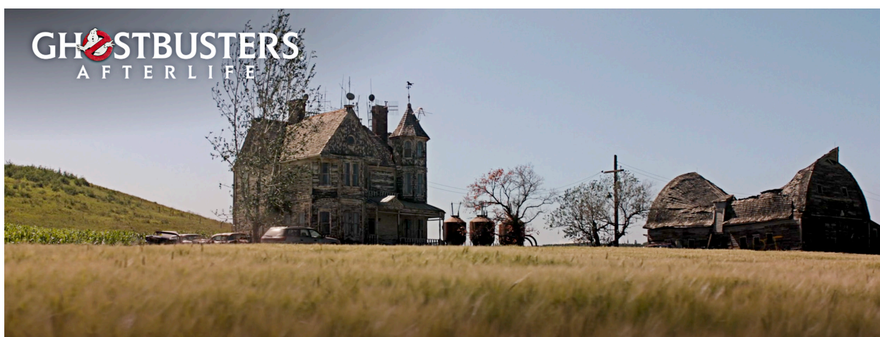
Figure 1. Spengler's Dirt Farm in Oklahoma

since 1984. Aided by the surviving members of the original team and the physical manifestation of Spengler's ghost, the next generation of Ghostbusters dispatch the world-ending threat once more, trading the backdrop of Manhattan for the Oklahoma prairie.