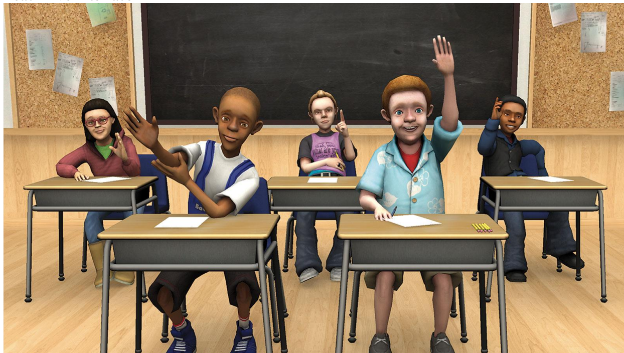
Figure 2 TeachLive Interface