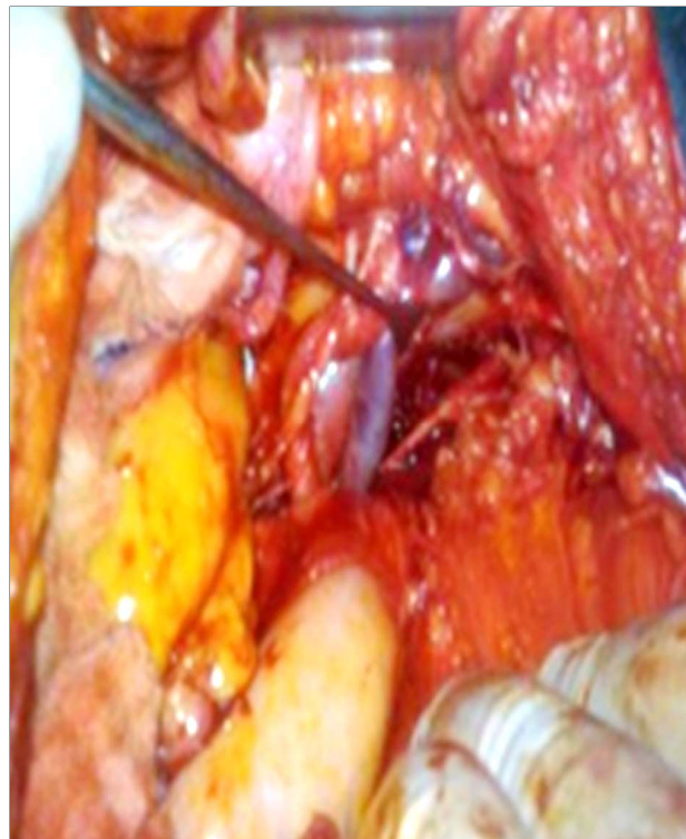
Figure 2. SLN situated in common iliac vessels