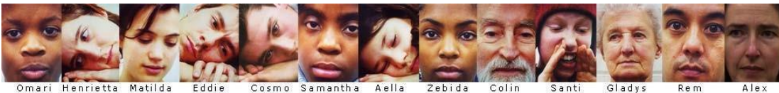
Images from the Passage website (2002), photographs by Pau Ros and Rosemary Lee

My own research refers to Lee's practice only if she has given prior feedback and permission to publish (as is the case with the present discussion). This section centres on her feedback on a description I made about observing aspects of the making of Passage . Lee's feedback stands here as caution to academic interest in choreographic practice: