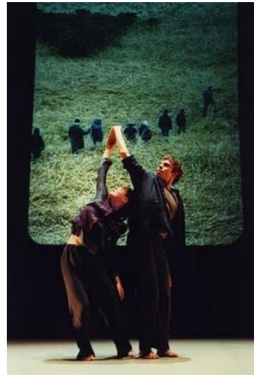
Lee's Passage (2001, photographs by Pau Ros)