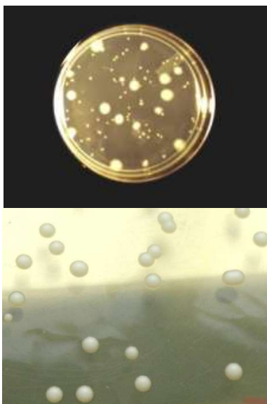
Figure 2. The dominant form of bacterial colonies of P. aeruginosa

A dose of irradiation will kill the microbial population present in a substance. The larger the bacterial population that is before irradiation, the more bacteria will remain after irradiation. According to Correa et al. 2019 irradiation inactivates bacteria by killing or inhibiting metabolic activity [9] The bacterial population decreases or does not exist at all with the increasing dose of irradiation given to the material [8][10][11]. The results data and the calculation of the number of bacterial cells per gram of talcum powder sample at various irradiation doses using the plate count method are shown in Figure 2.