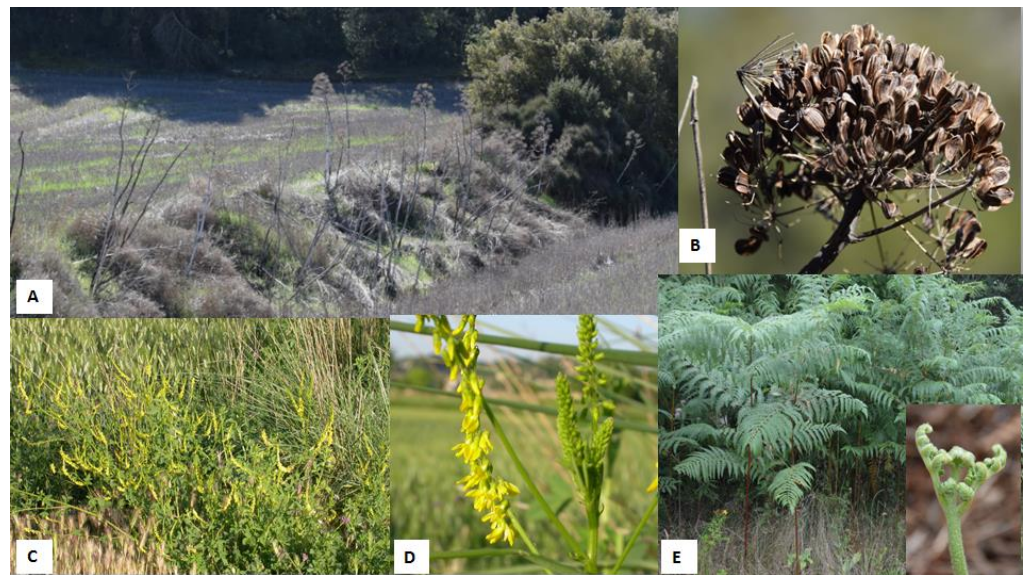
Figure 1. Some examples of plants associated with haemorrhagic disorders. (A) Giant fennel ( Ferula communis ) on an embankment. (B) General aspect of fruits of giant fennel. (C) Sweet clover ( Melilotus officinalis ) grown on the edge of a wheat field. (D) Flower of M. officinalis . (E) General aspect and fronds of bracken fern ( Pteridium aquilinum ). The small picture shows a “fiddlehead” sprouting.

In addition, another important plant, the bracken fern ( Pteridium aquilinum ), must also be included in this group. The haemorrhagic disorder caused by bracken fern is not mediated by coumarins. In this case, the anaemia is due to platelet depletion [12].