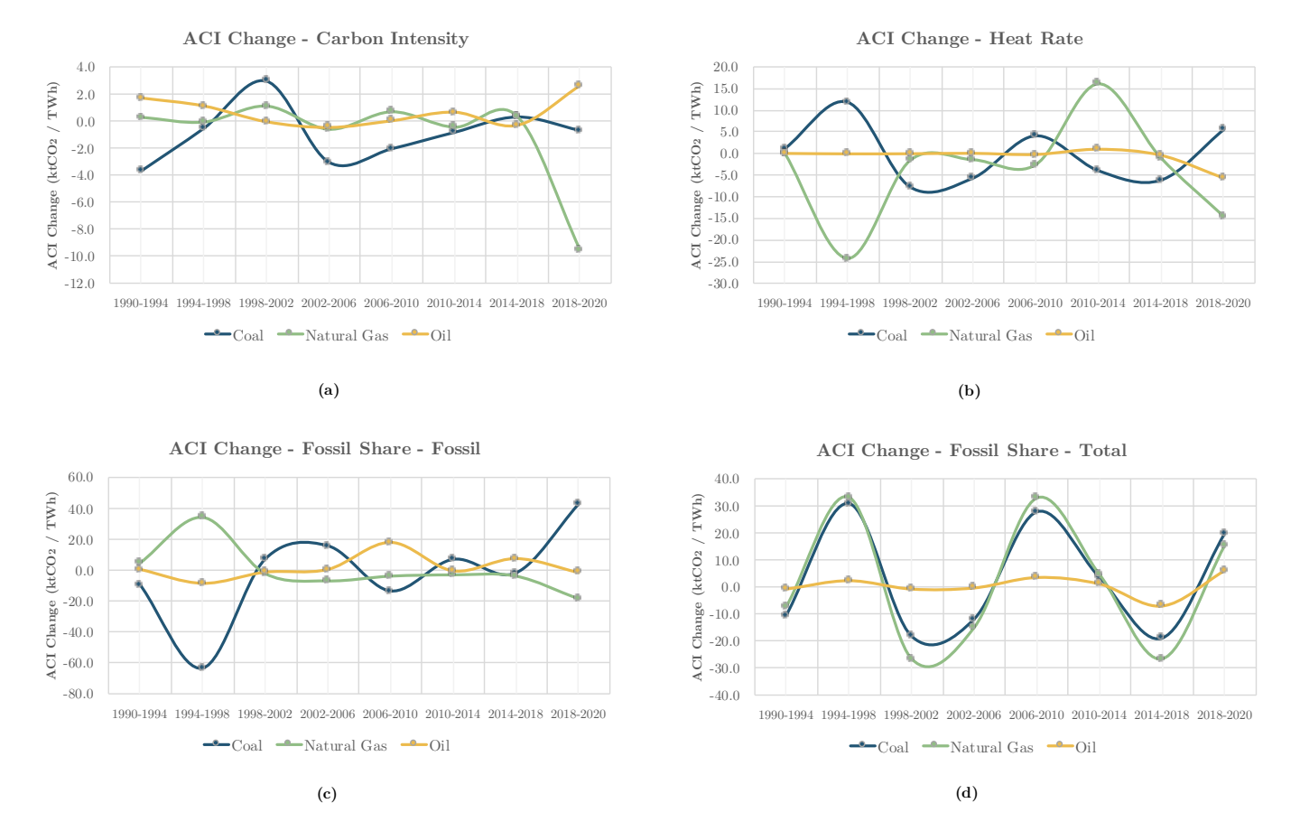
Figure 3. ACI Decomposition-Fossil Fuels Analysis.

In order to visualize the temporal behavior of the changes in the ACI contributed by each primary fossil fuel in each driver of the decomposition, Figure 3 shows the temporal changes in each driver. In this graph, it is easier to observe the changes in fuels quality, transformation efficiency and the conformation of the electric energy mix and their respective effects on the changes in the ACI in Colombia over time. However, it is evident that there is no clear trend in any of the drivers, which would show the absence of regulations in operation and policy that contribute to control these factors.