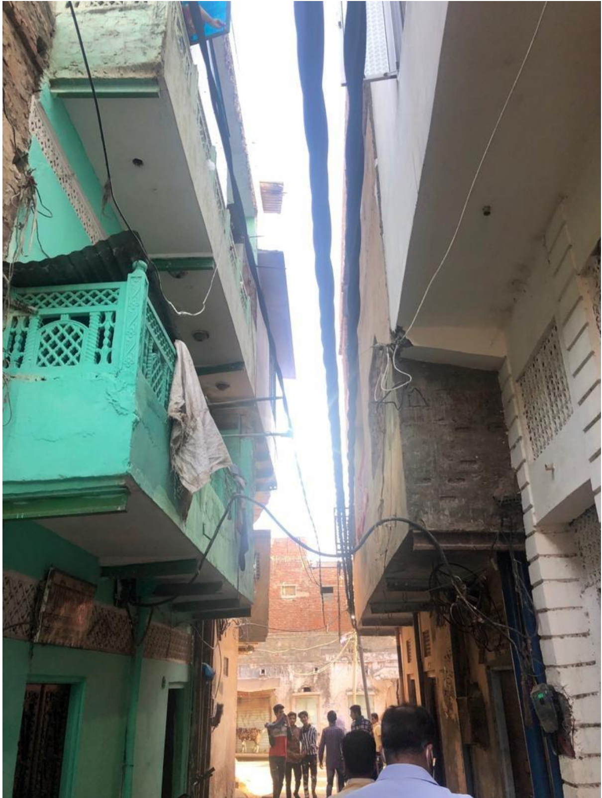
A street in Ramganj

In houses this small there is no real distinction between shared and personal spaces, with people, objects and chores usually occupying all available space. Under 'normal' circumstances this is mostly manageable because at least half the members of the house (mostly men) leave in the morning only to return for the evening meal and again leave for