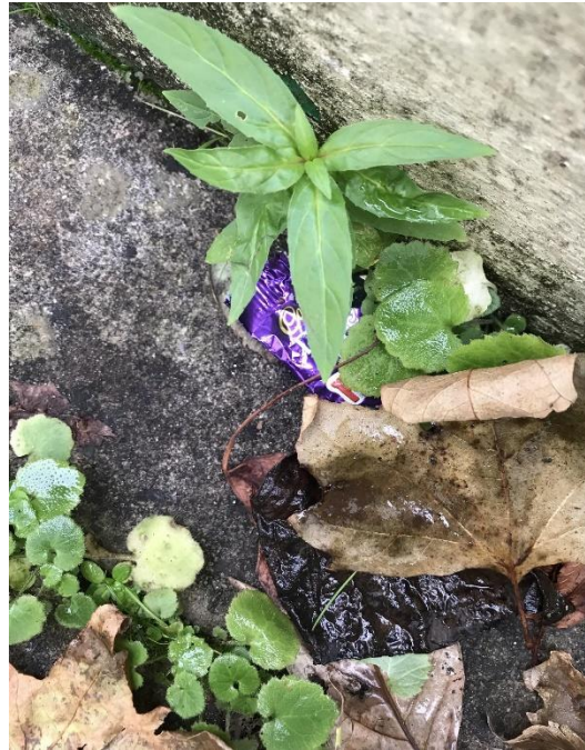
Figure 4. A Plastic Chocolate Wrapper

A walk on the beach. Brightly coloured chocolate wrappers swirl gold and blue in the wind, faded by the sun and sea. Wrinkled wrappers transiently peak through the pebbles, ever reconfiguring, turning, and returning with the tide. The wrapper offers a faint configuration of its past intended as an attractive protective coat to a deliciously sweet cocoa, milk, and sugar concoction. A walk on the beach will never be the same.