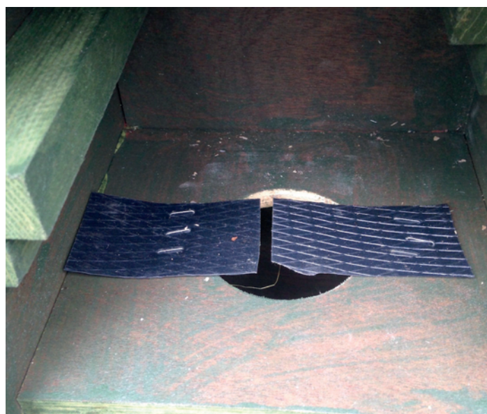
Figure 2. Images of the flexible black plastic tabs in position (a, left) viewed from above (b, right) viewed from beneath.