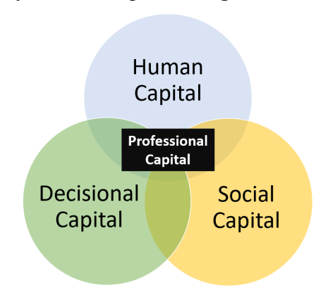
Figure 1 Professional Capital, Hargreaves & Fullan, 2012

conceptual framework to fully address our research problem and how it relates to the principalship.