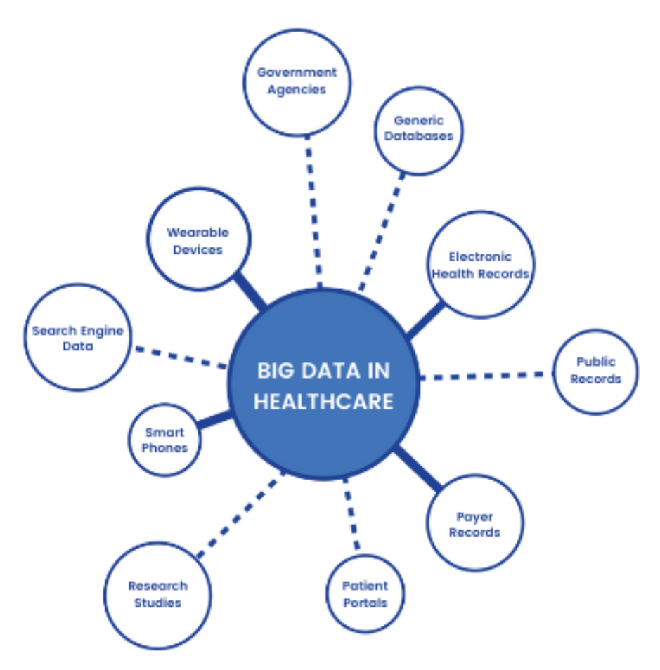
Fig. 1. Big data sources in healthcare

Data science provides tools and methods for extracting real value from unstructured patient information (Miah et al., 2022). This knowledge will ultimately contribute to greater efficiency, accessibility and personalization of health care. With the opportunities created by the digital and information revolution, the healthcare industry can take advantage of the potential of big data. Big data analysis provides increasing value for the future of health by improving the quality of care and outcomes, and the provision of cost-effective care services. The predictive nature and diagnostic aspect of the Big Data Analysis model in health allow for a shift from experience-based medicine to evidence-based medicine.