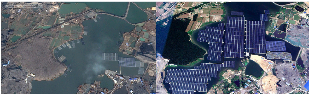
Figure 2. Early and late stages of installing 70-MW FPV on a flooded coal mine in Anhui, China

large extent relies on the stability of anchoring of these power plants. Anchoring also constitutes an important part of the expenses. The reported anchoring costs for the Anhui project in China, Figure 2 , are around 10 USD/kW, which is shallow water, is a large-scale project, and has benefited from the local manufacturing facilities and labor force. But in Japan, the anchoring price is substantially higher, and the aim is to reach 30 USD/kW or less ( Pouran, 2018a, 2018b ).