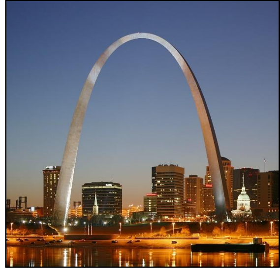
Fig. 2. The Gateway Arch is an example of a modern megaproject that serves a civilian use. While other plans for the Mississippi riverfront included a private business district, a bold plan to improve St. Louis’ tourism and recreational capacity was approved in 1935. Image: Daniel Schwen, 2011.

Altshuler and Luberoff explain in detail the four “political eras” in which megaproject took form in the United States. First, the pre-1950s era was defined by private development and planning. “Public” infrastructure projects such as factories, like the Ford River Rouge Complex in Detroit, and power plants, like the Pearl Street Power Station in New York, were inspired by market forces and followed through by industrialists. Costs associated with these projects were carried by private investors, and the role of government was to help secure the resources and the physical land required to complete the projects. However, this model gradually changed across