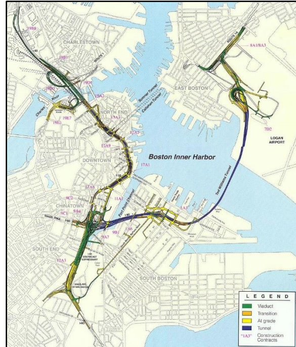
Fig. 3. Boston’s Big Dig is a controversial megaproject that saw the construction of new bridges, tunnels, and interstate highways to improve traffic flow and traffic control in Boston’s urban core. Complications and lost time took the $4 billion project to costing over $14.6 billion.

As mentioned before, lost time costs (LTCs) can vary from being tangible costs in the form of material and finances, but they can also be subtler. For example, Boston’s Big Dig project, where the city partnered with federal departments and private investors to complete a host of infrastructure improvements expanding urban interstates, started to encounter tangible LTCs when the project initially missed its 1990 completion date. As time carried on, the costs associated with construction started to pale in comparison to the LTCs which included mounting legal fees, environmental damages, and political disappointments. 17 While these were some of the more noticeable LTCs associated with the project, some other costs were being added to the projects total price tag. These included the costs of traffic congestion caused by construction, damages caused to properties outside the scope of the project, and the costs associated with developers having to research and secure new forms of funding in pay-as-you-go construction. 18 Every problem the builders encountered