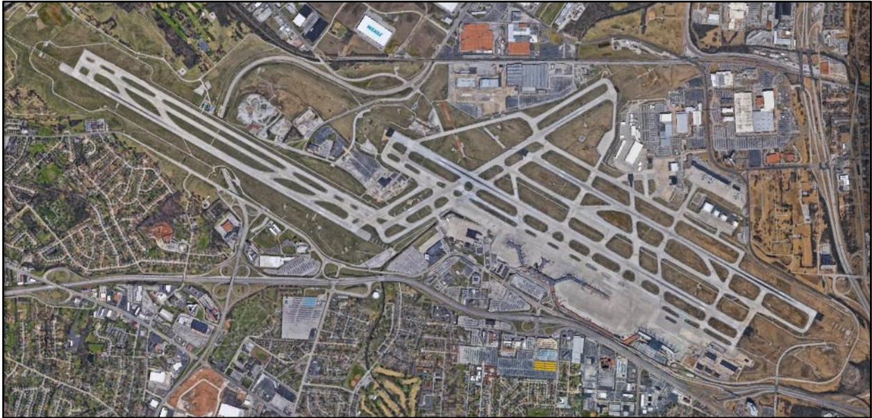
Fig. 4. Lambert International Airport in St. Louis County has typically grown to meet demand for more flights and carriers. However, the most recent runway extension, the runway on the left half of the picture above, is a megaproject which was aimed at expanding service capabilities and attracting more business, rather than responding to market pressure. This controversial gamble has left its mark on the city of Bridgton, Missouri and the airport's legacy.

Introduction: From its humble beginnings as an airfield which could only service light propeller planes and private balloons, Lambert international airport now boasts facilities which support jet fighter training and international commercial flights. As mentioned earlier, airports like Lambert received much attention in the 1940s and 1950s, and its multiple expansion and renovation projects were often treated as parts of a larger megaproject scheme. However, the most controversial expansion to the airport was the recent addition of the “11-29”, 9,000-foot runway in 1998, completed in 2006 27 . As people might have expected, this expansion project took the airport's megaproject legacy to another level, since the new runway can be considered its own megaproject in terms of size, scope, promise, and cost. Now, Lambert's megaproject