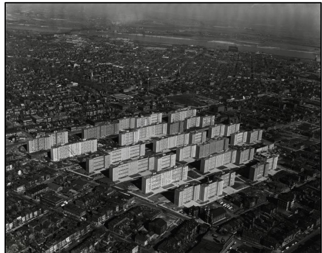
Fig. 6. The Pruitt-Igoe housing complex was a housing megaproject designed to solve St. Louis' affordable housing crisis in the 1950s. Though it ultimately proved to be an economic and cultural failure, its legacy proved that some residents' lives could be improved through megaprojects, even if only briefly.

Redevelopment strategies for the more impoverished northern side of St. Louis city have been a familiar point of discussion in the development community. First, the area has been largely defined by the legacies of two major development legacies, the Pruitt-Igoe housing projects and developer Paul McKee's Northside Regeneration Redevelopment Area. While Pruitt-Igoe's legacy in the city's history is