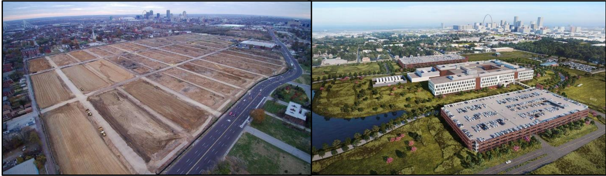
Fig. 5. Cleared land (pictured left) in the St. Louis Place neighborhood awaits construction of the new NGA campus (artists depiction right). To make room for the development, residences were demolished or physically moved to another location.

Introduction: The National Geospatial-Intelligence Agency is a unique entity within the Federal government’s defense and intelligence apparatuses. At a glance, the NGA offers combat support to all branches of the armed forces and advises policymakers and the president in three primary areas. These include plotting counterterrorism measures, identifying and tracking weapons of mass destruction, and monitoring global political crises. 65 In addition to being headquartered in Springfield, Virginia, the NGA has satellite locations in Arnold and St. Louis, Missouri. Now, the St. Louis branch has been getting recent attention from the national media and is setting the St. Louis populace abuzz with anticipation and anxiety.