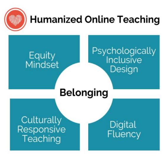
Figure 1. The Four Dimensions of Humanized Online Teaching

In STEM education, where intellectual ability is often perceived to be at the center of success, Black, Latino/a/x, Indigenous, other students of color, and women of all races and ethnicities are more likely to doubt whether they belong due to past discrimination (Park et al., 2020, 2022) and exposure to negative academic stereotypes about their identity group(s) (Steele, 1997, 2010; Steele & Aronson, 1995; Steele et al., 2002). Instructor—student relationships based on trust and mutual respect are the antidote to these threats and serve as the "connective tissue" between students, engagement, and learning—in all modalities (Pacansky-Brock et al., 2020).