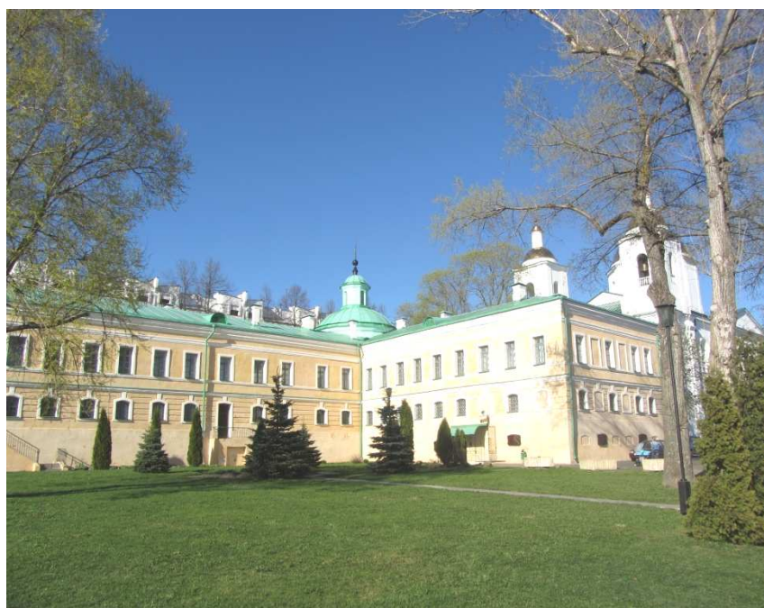
Fig. 2. Monastery building

The monastery building is L-shaped (fig. 2). In its east wing there were the monks' cells, the Father Superior's room, in the angular part of the building there were two winter churches dedicated to St. Catherine and to St. Euphrosinya. The monastery complex is now monument of Baroque architecture with some elements of classicism. It is supposed that the project of the famous St. Petersburg architect Giacomo Quarenghi was used during its construction in the XVIII th century.