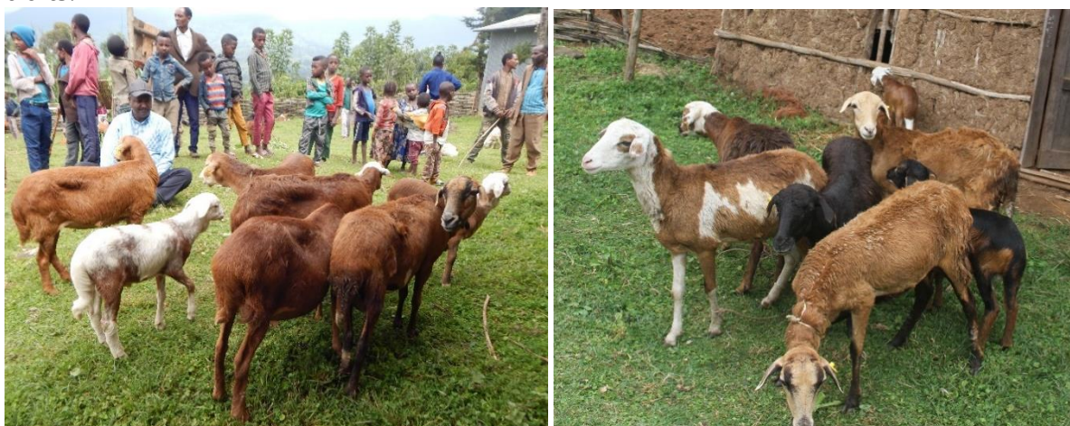
Figure 2. Top Bonga ewes (left) and worst ewes (right) selected by the community within their flock.

Farmers, enumerators, and development agents were trained on how to identify and remove non-productive breeding females from their flocks. The removal of infertile females from the flock is done using ultrasonography. Farmers in Menz CBBP agreed to cull sheep with more than seven parities because their performance was anticipated to deteriorate at this stage. Furthermore, because undesirable coat color and morphological traits are linked to market value and breed traits, farmers agree to cull sheep with these traits.