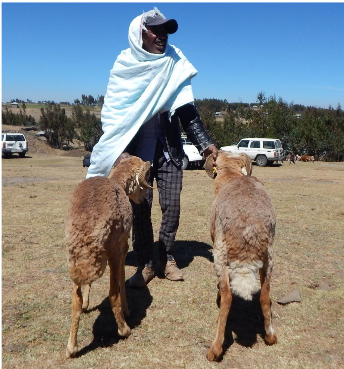
Figure 1. Best breeding sires in Menz CBBP