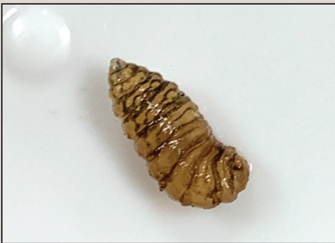
FIG. 2. Sarcophagid larva following removal from the aural cavity.

a perfect opportunity for the adult fly to deposit the larvae. This T. c. carolina recovered without incident and has been released where it was originally found.