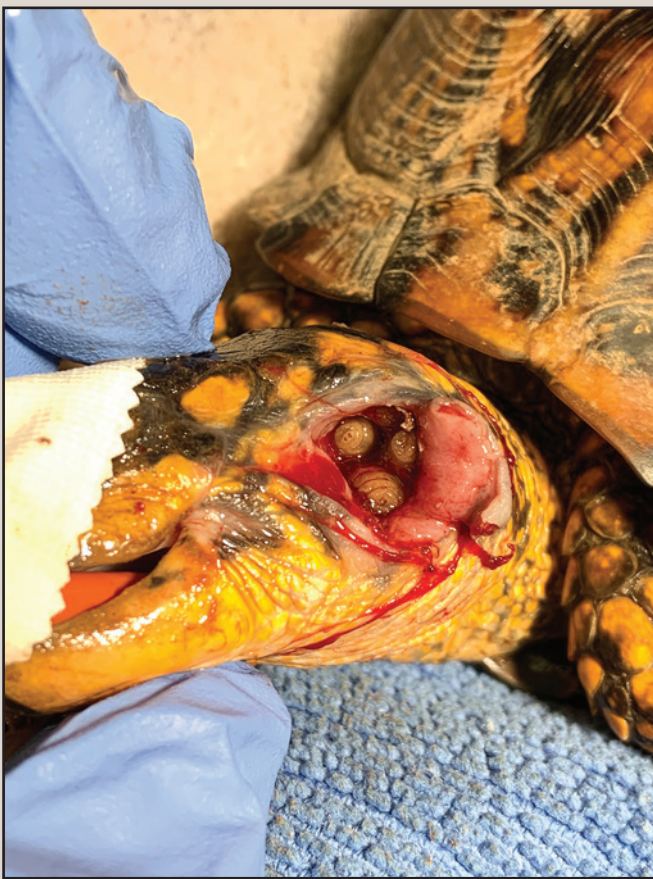
FIG. 1. Sarcophagid larvae in the aural cavity of an adult male Terrapene carolina from North Carolina, USA, following surgical incision and debridement of the abscess.