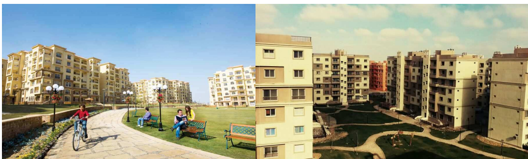
green and play areas

This suggests that yes, indeed Madinaty has unconsciously applied several aspects of smartness. The case at hand can be considered as a pilot, underdeveloped project that can be developed into a real “smart city” example. Despite the fact that some aspects are still in their birth phase, and other aspects are still controversial, yet, it can be argued that such project is an integrative approach for understanding initiatives that smart cities revolve around, such as governance, policy context, economy, technology, roads, open/public spaces, buildings and infra structure, people and community and safeguarding the natural environment.