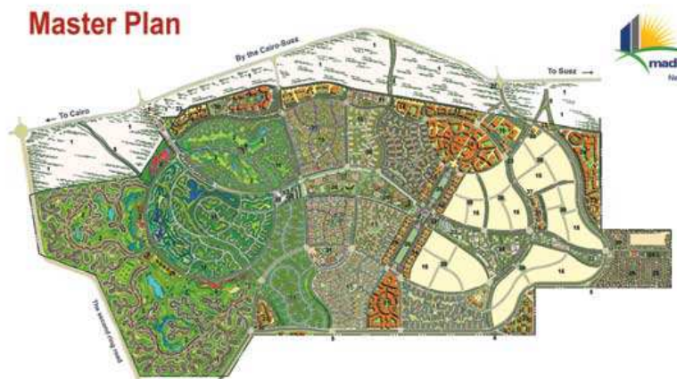
Madinaty Master Plan

Madinaty that provide major services; open-air shopping areas (like the promenades, for pedestrians only) or malls for international brand names. Technology is utilized to optimize the water used for the irrigation of the existing gardens and golf courses available.