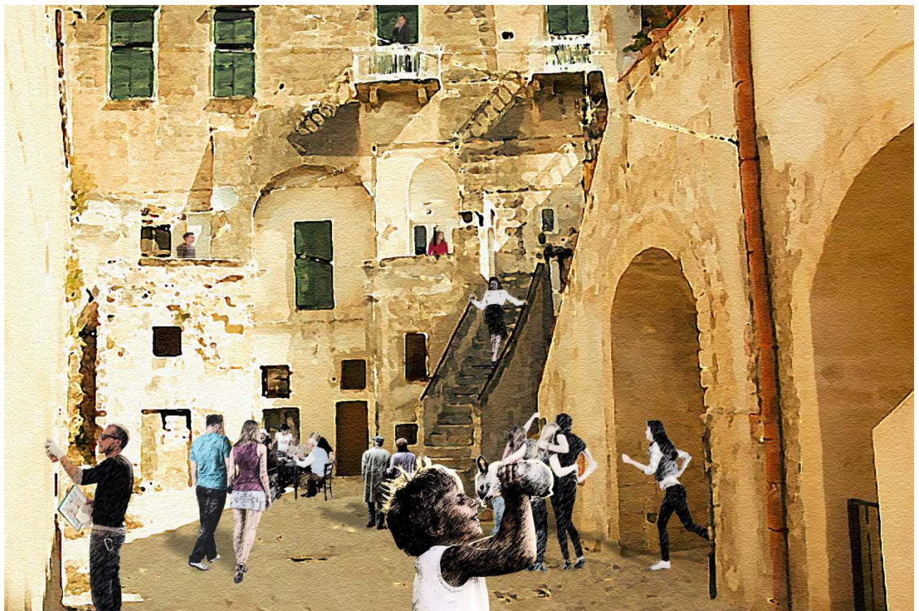
Fig. 2: Social life in the “urban neighbourhood”.

You can therefore say that the idea of looking today at the Sassi as a potential Smart City starts essentially from its particular dense morphology, that before any other device imposed from the top, would encourage the development of a balanced lifestyle among the most modern housing needs and the traditional social vocation of the historic city made of rich and meaningful human relationships.