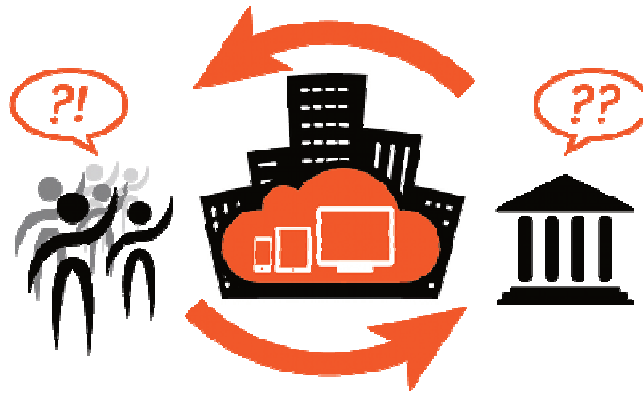
Fig. 1: An important goal of the b-Part project is to create a sustainable and dialogue-like participation process between the public and city authorities [own graphic].

involving end-users through lab tests and urban field trials, the project combined user-centred pervasive interaction research with social studies (to explore the capability to engage citizens) while at the same time investigate democratic innovations (to ensure citizens' input integration into the overall political decision making process). The resulting tools, services and guidelines will help to promote and strengthen the involvement of citizens in urban governance by using contemporary technology.