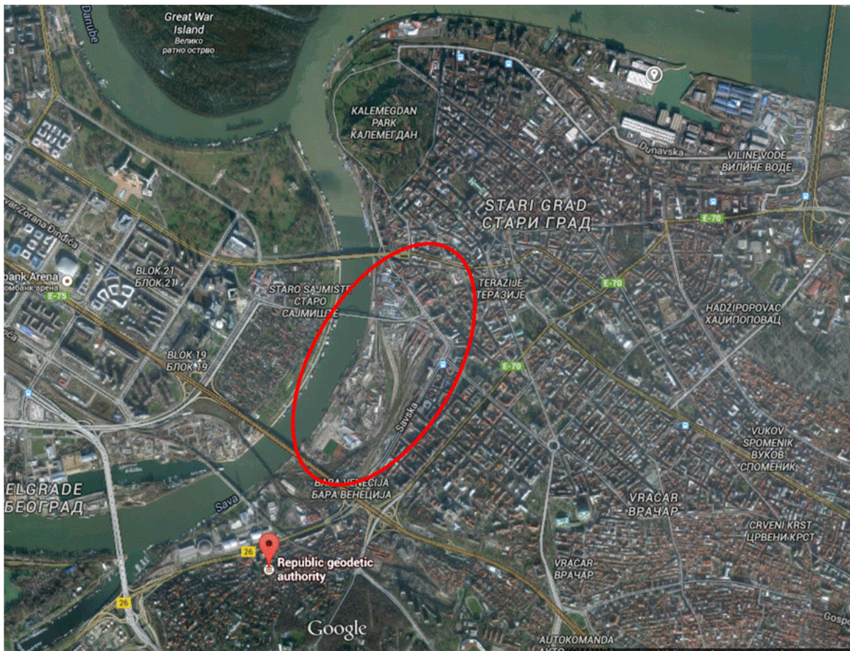
Figure 1. Site location of the project "Belgrade Waterfront"

competition for projects of such magnitude. Although this statement was later retracted, the contradiction was never fully cleared up. In addition, the role of the state in the project remained vague, in particular in terms of its financial commitments in constructing infrastructure at the site before construction could begin in earnest.