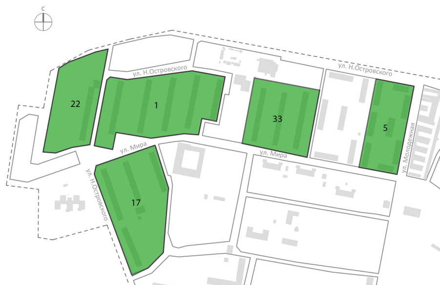
Fig. 2: The scheme of residential plots development marked in Table 3

The testing objective was to study the possibility of development consolidation within the block taking into account the maximum feasible density, established by the federal health standards. Method of calculation is set out N.S. Rusakova, V.A. Sosnowski [2006] and is based on a comparison of the maximum feasible current density and housing.