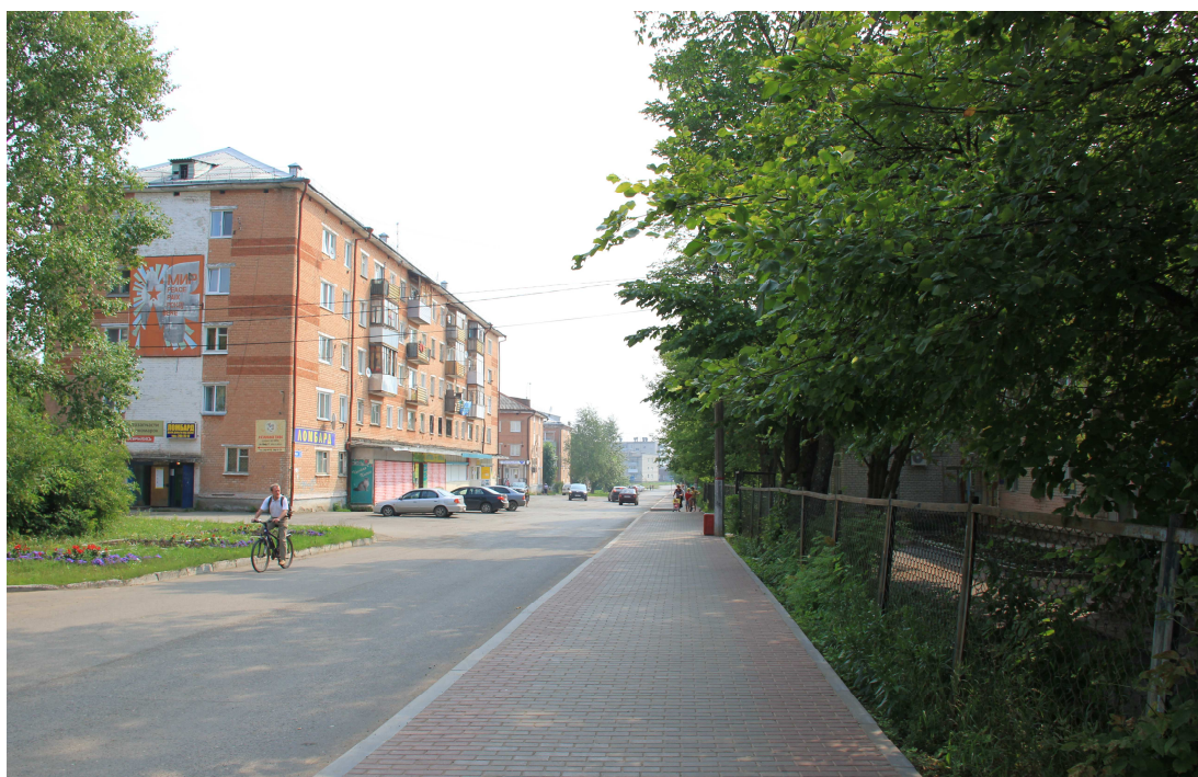
Fig. 1: General view of Novye Lyady

The problem considered in this paper is a part of comprehensive benchmark problem of functional development (public and residential functions) forecasting of the urban territory selected areas.