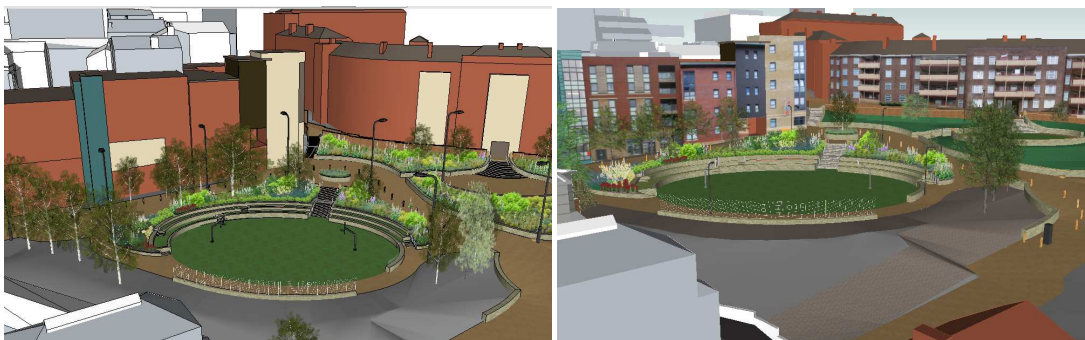
Fig. 2: SketchUp model for the survey. Fig. 3: Final SketchUp model with textures

Considering that this survey is based on the draft model, these scores could perhaps be higher if the latest version of the Edward Street Park model with textured building facades (Fig. 2), which gives the model a greater sense of place, would be used.