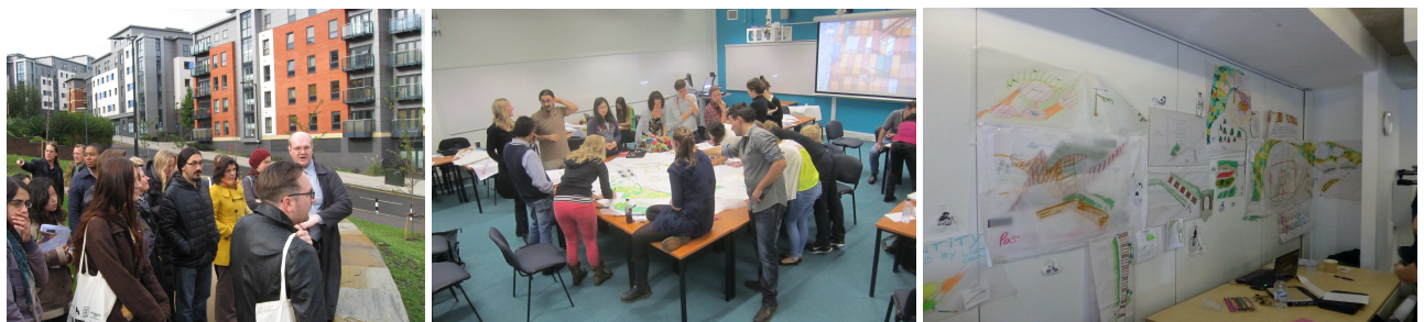
Fig. 4-6: Charrette: After a site visit students using visual representations to convey their design ideas

In addition to the survey a design charrette for Edward Street Park took place in October 2013 with students from three participating universities of the UK and the Netherlands. The organisers tried to widen the list of participants to engage local residents (including students, migrants, young people and new residents), small and medium enterprises and NGO's (e.g. ZEST), but due to a weak response the charrette was run as a cooperation between the academic departments of the three participating universities of the UK and the