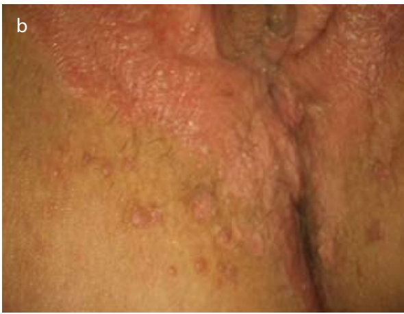
Figure 2. Anogenital psoriasis (a) with sparse genital warts (b) or exacerbation of multiple anogenital warts following different treatment modalities for psoriasis and genital warts.

We employed physically ablative methods like liquid nitrogen cryosurgery, electrocauterization, and curettage, applied topical agents like 0.5% podophyllotoxin solution, 20% podophyllin, and 80% trichloroacetic acid, and treated the psoriatic lesions with a short course of moderate-potency corticosteroids and tacrolimus ointment. All therapeutic attempts were ineffective for curing both diseases. Our patient either had psoriasis with sparse genital warts or exacerbation of multiple anogenital warts (Figure 2, a-b).