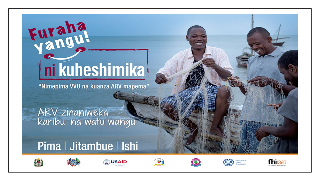
Figure 3. Translated to "My Happiness is to be Respected. I Have Tested for HIV and Have Started ART Early. ARV treatment Keeps me Close to my People. Test, Be Aware, Live."