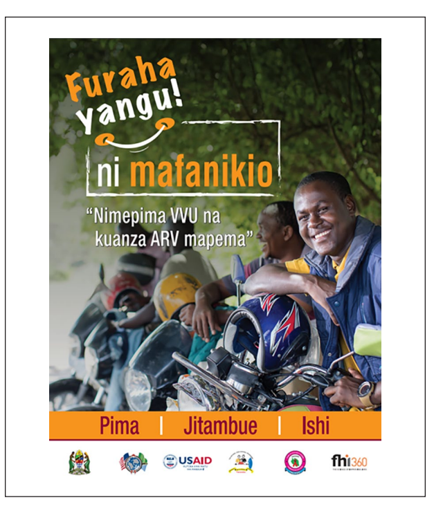
Figure 2. Print material of men living with hiv used during campaign events small group discussion through interpersonal communication. Translated to "My Happiness is to be Successful. I Have Tested for HIV and Have Started ART Early. Test, Be aware, Live"

At the community level, strategic outdoor billboard executions (Figures 2 and 3) emphasized key Test and Treat service calls to action messages with men in the pictures. Mass media included strategic radio spots targeting high male listenership radio programs with ties to social media content across Facebook, Instagram, and Twitter social media assets designed to further engage men in interactive reflection and dialogue around HIV risk perceptions,