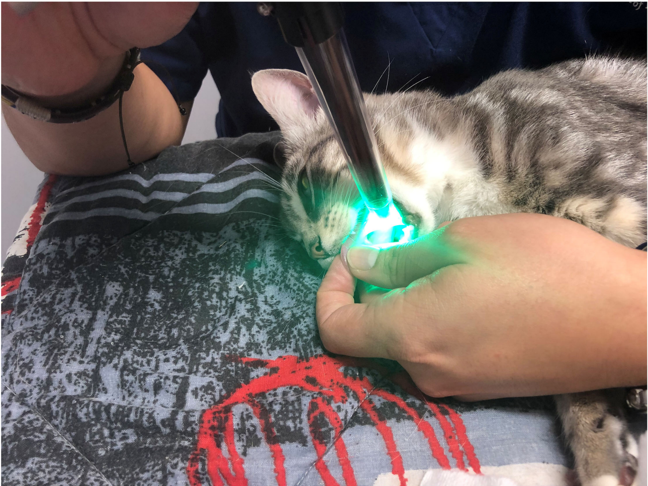
FIGURE 2 | Probe positioning of the sidestream dark field videomicroscopy camera for GlycoCheck® analysis.

the parameter perfused boundary region (PBR). Larger PBR represents thinner EG and vice versa ( Figure 1 ). This tool has recently been validated for use in dogs (17). Although SDFV has been previously used to assess microcirculation in cats, dogs and people, using GlycoCheck® software to estimate EG thickness has not been done in felines (18–22).