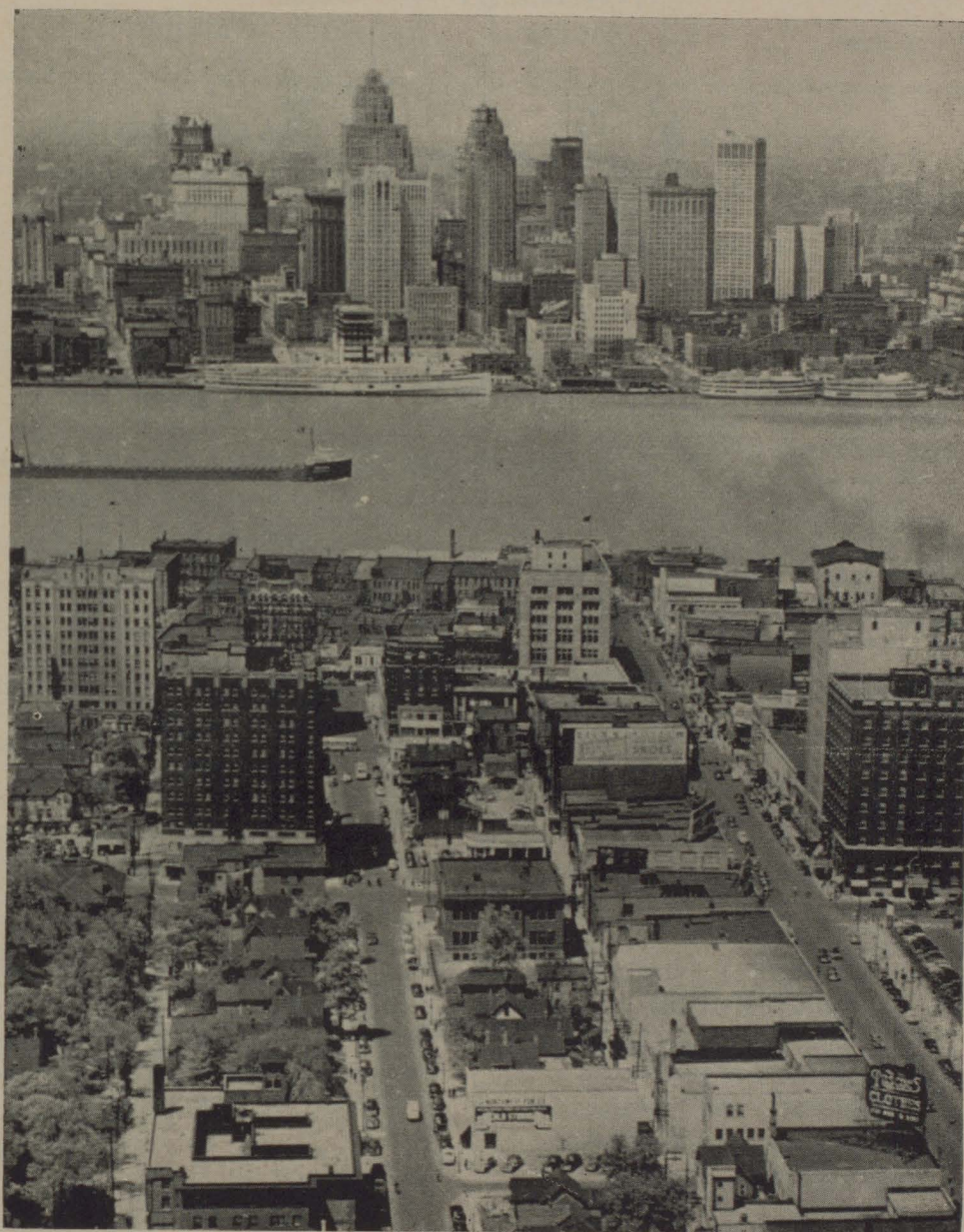
Windsor - Detroit — The World's Friendliest International Boundary