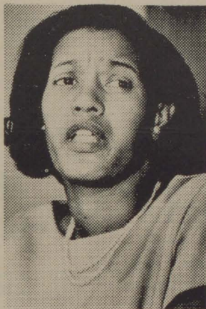
MRS. MYRLIE EVERS

Mrs. Myrlie Evers the new "First Lady" of the National Association for the Advancement of Coloured People (U.S.A.) stood before 30,000 audience in Chicago July 4, 1963, standing stately on the speaker's platform facing a dozen radio and television microphones, Mrs. Evers spoke quietly with tears streaming down her cheeks and choked with emotion of joy of pathos and sadness said with a warmth, with conviction and eloquence which made a majestic picture of hope and courage to thirty million American Negroes and countless numbers of White Americans and Canadians as she spoke. This giant-sized audience stood choked with intense, interest as did her two older children who sat in the front row.