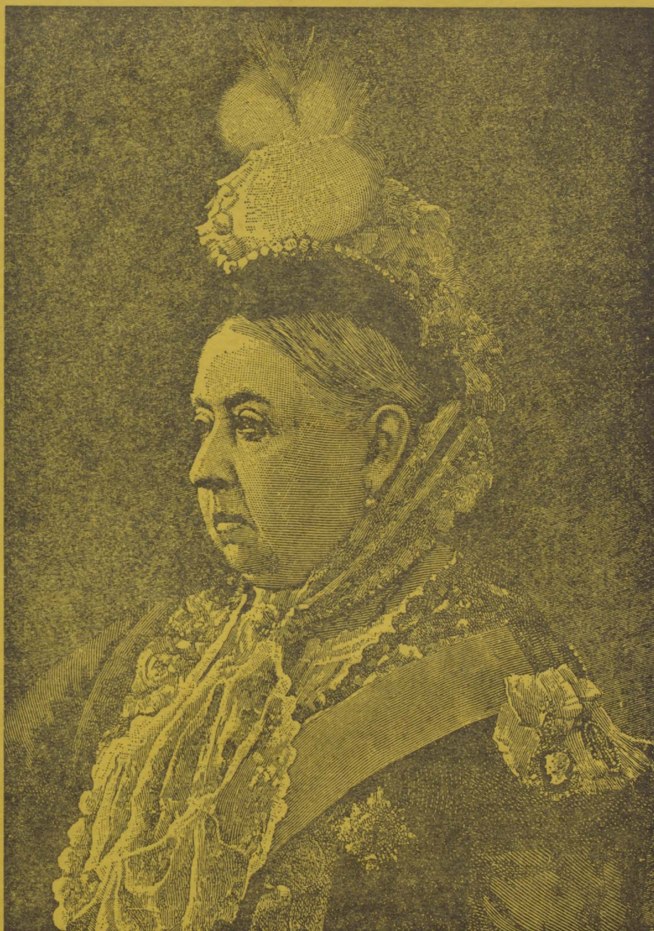
QUEEN VICTORIA Reigned 1837 - 1901

32 ND EMANCIPATION DAY CELEBRATION WINDSOR - ONTARIO - CANADA