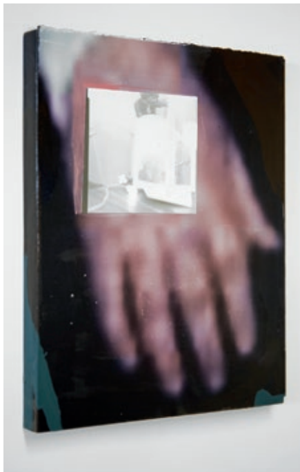
Recollection #1, silver gelatin print, digital print, acrylic paint.

Materiality is essential to developing my ideas, subordinating form to process, and collecting images, materials, and objects that can be reassembled, and as a result, coalesce to reveal a new image. I often enlist obliterated images downloaded and printed from the internet, inherited objects, and embrace traditions of painting and photography to build connections between memory and imagination using mimicry and abstraction. When I began making