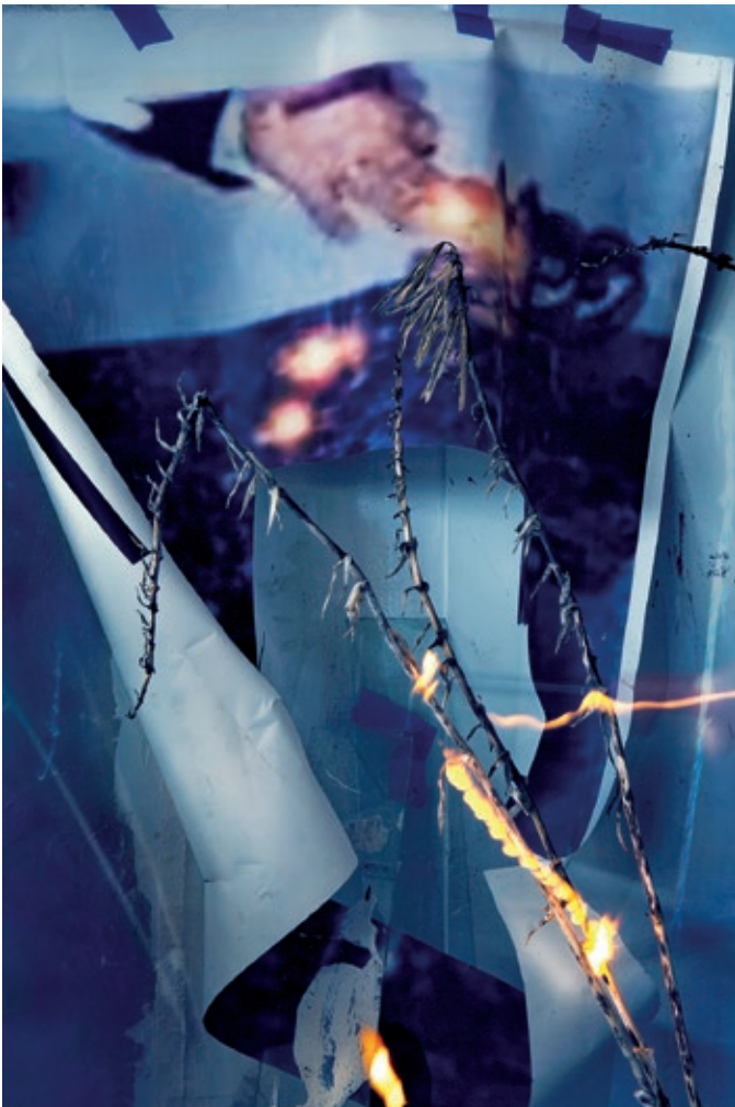
My Withering Window, 2022, digital photography.

Since I began making artwork, I am continually revisiting symbols of clouds, candles, and wilting plants to reference ideas of heaven and mark passages of time.