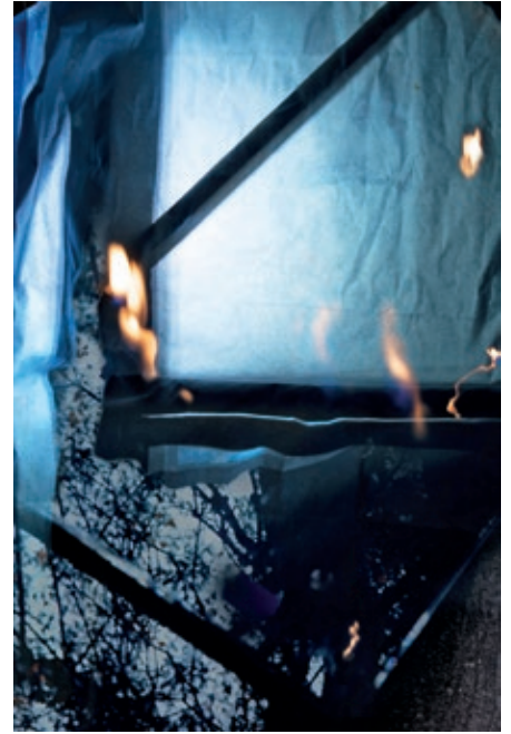
Interrupting A Blue Night, 2022, digital photography.