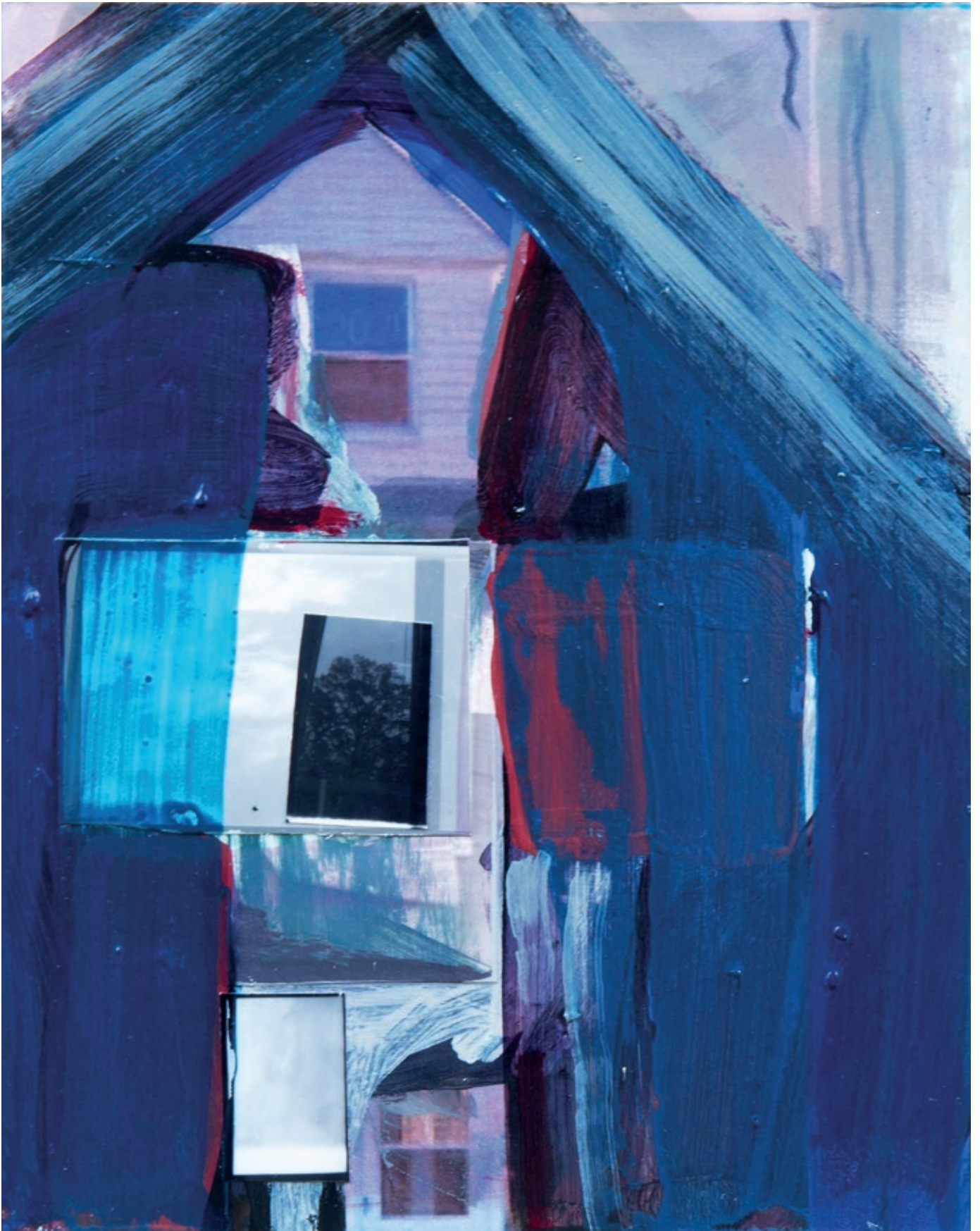
Recollection #12, 2022, Google street view download, silver gelatin prints, acrylic paint and ink.