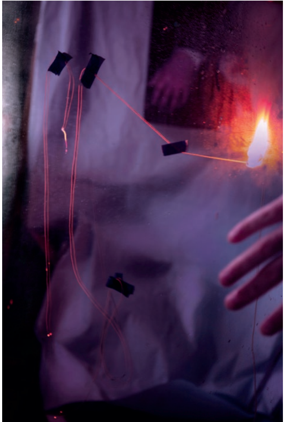
Held By Hands, 2022, digital photography.

to a life lived and gone too soon is what gives them urgency. An attempt at recollection – the challenges of memory and the pain it can inflict. Returning to the catharsis of repetition, sadness might feel more like an environment, or a process: shelter in place; remember, forget, repress, excavate, repeat.