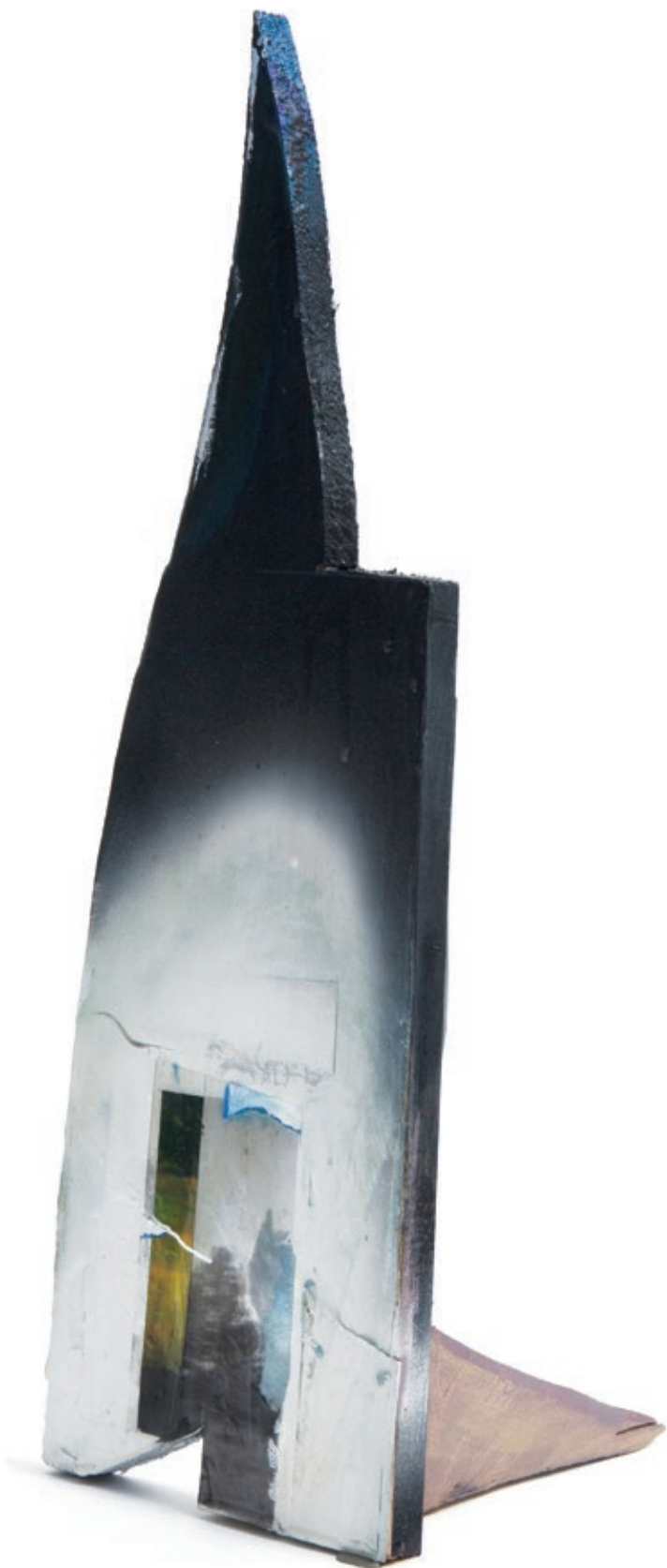
Magical Thinking , 2022, sculpture, silver gelatin prints, acrylic paint, wood.