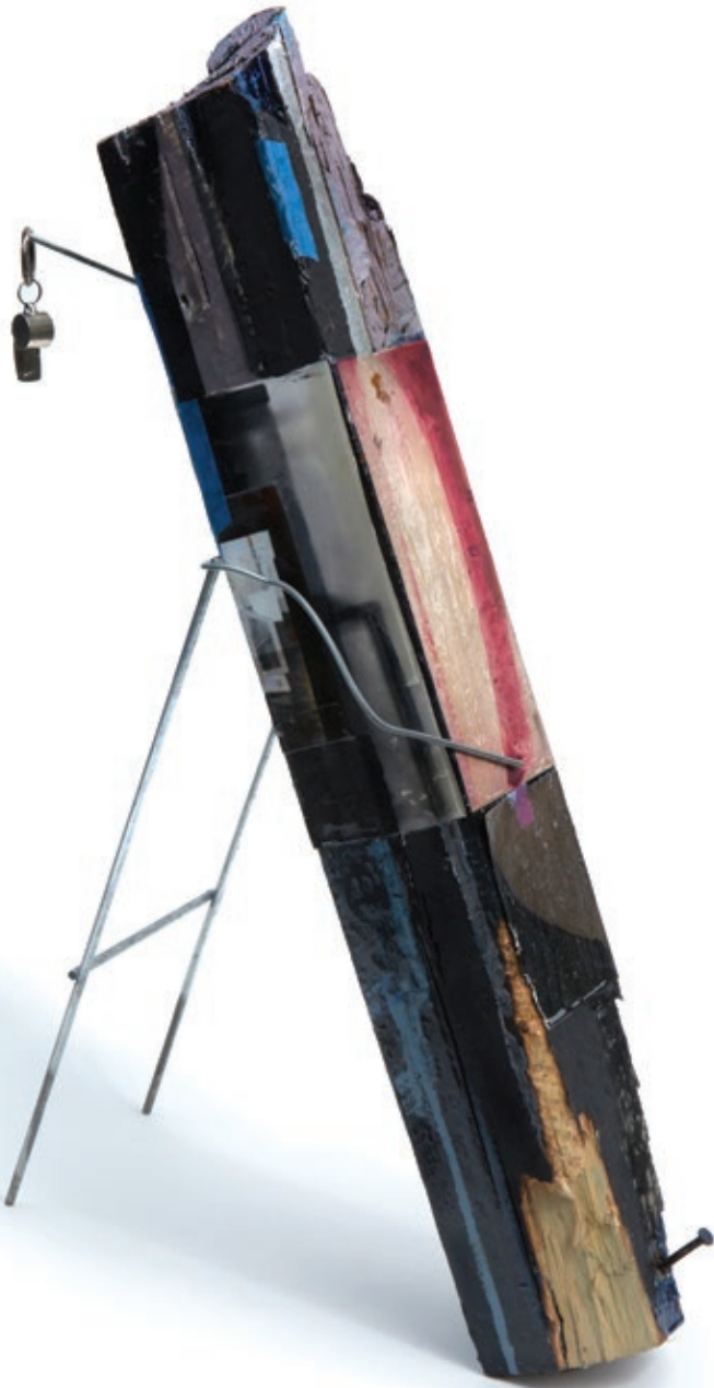
Nightfall, 2022, sculpture, found wood fence post, silver gelatin prints, acrylic, metal wire, and whistle.