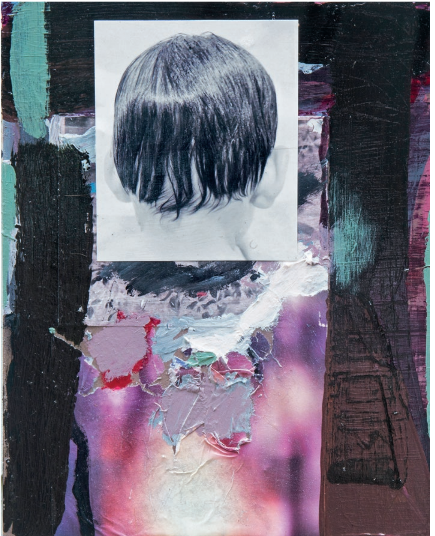
Recollection #11 (Owen), 2022, digital photographs and acrylic paint.