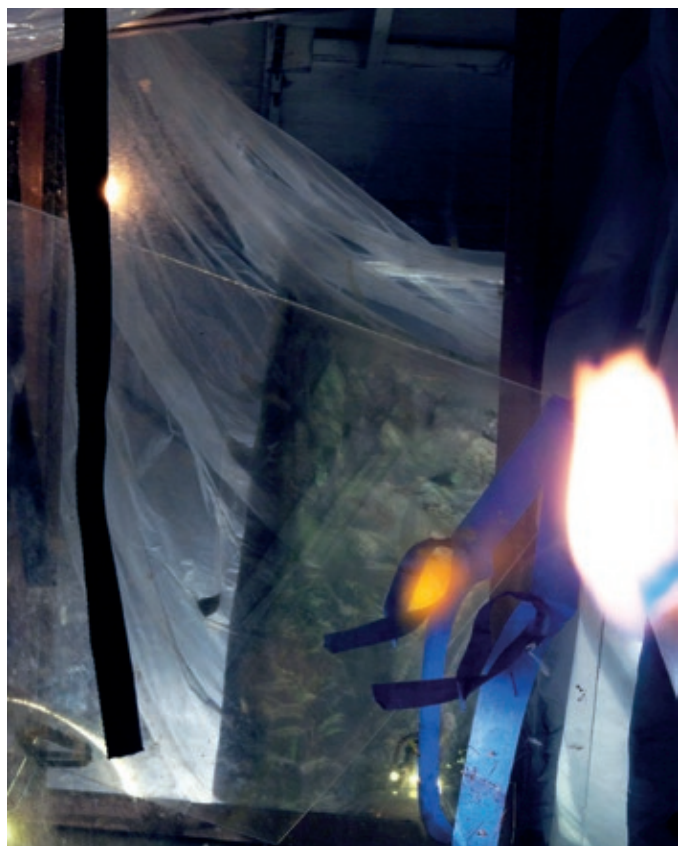
Melancholy Minus Its Charms , 2022, detail, digital photography.