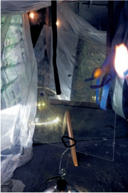
Melancholy Minus Its Charms, 2022, digital photography.