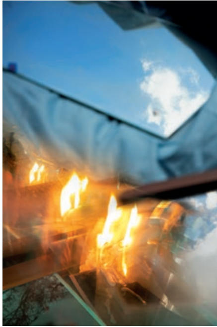
Slow Swirl At The Edge Of The Sea, 2022, digital photography.