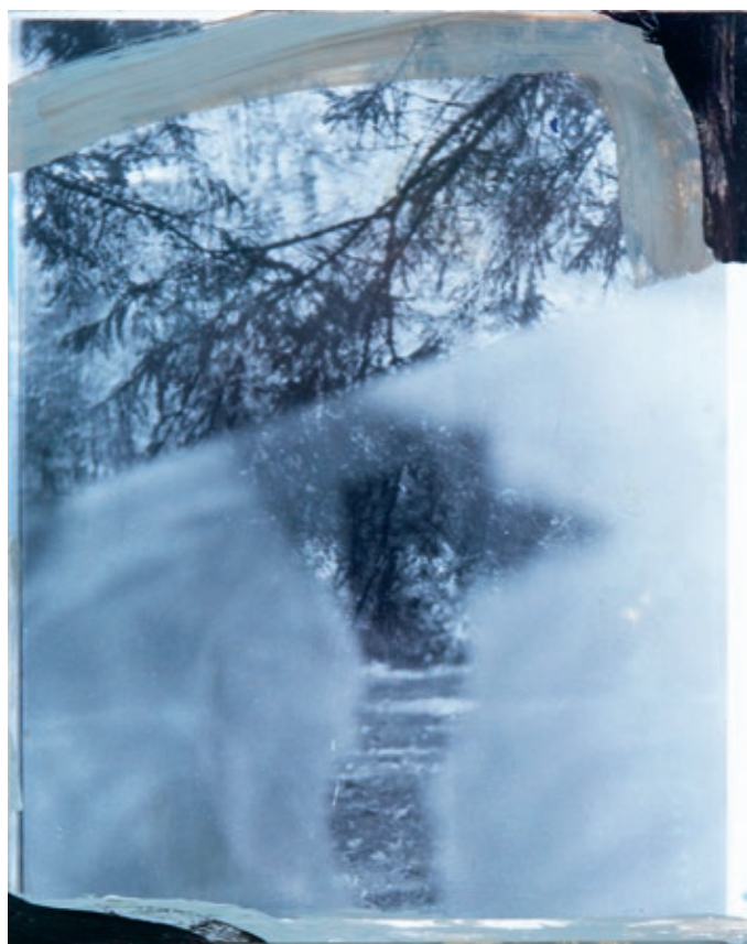
Recollection #4 , 2022, silver gelatin photograph and acrylic paint.