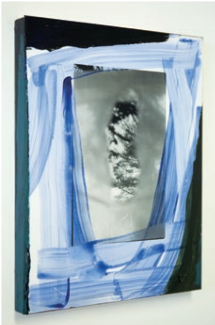
Recollection #10, 2022, silver gelatin print and acrylic paint.