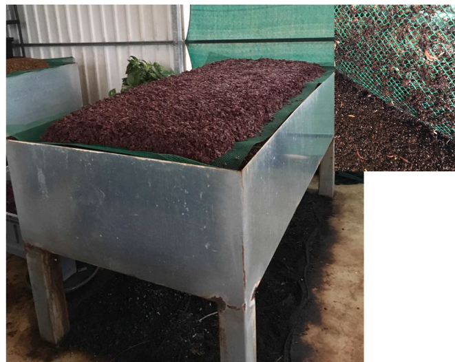
Fig. 1. Overview of the pilot-scale vermireactors used in the present study. Fresh layer of grape marc on top of the plastic mesh for the performance of the vermicomposting trial in the presence of the earthworm E. andrei .

For the purpose of the present study, a new layer of each grape marc (50 kg fresh weight, fw) was placed and no more substrate was added to the vermireactor until the end of the trial, that is for the 63-day period. The species E. andrei is characterized by a high rate of consumption,