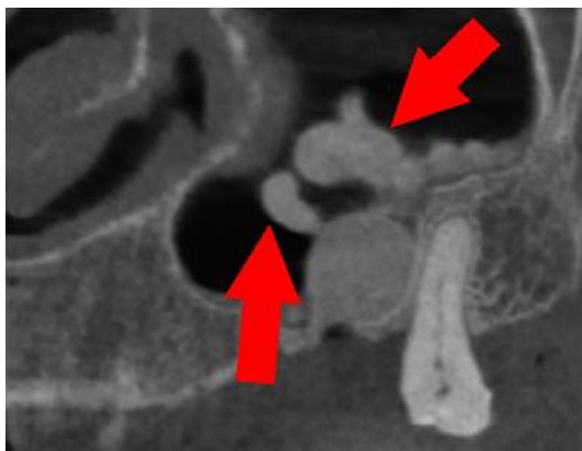
FIGURE 2 CBCT Panorex image taken immediately after grafting procedure. Red arrows indicate graft dissemination into the sinus cavity due to membrane perforation

sinus width [OR = 15.5; (95%CI: 3.59–56.59); p = .000 ] (Table 4). Multivariate analysis was not performed as no other predictor variable reached statistical significance. It was not possible to perform a statistical analysis for the post-operative complications due to their extremely low numerosity.