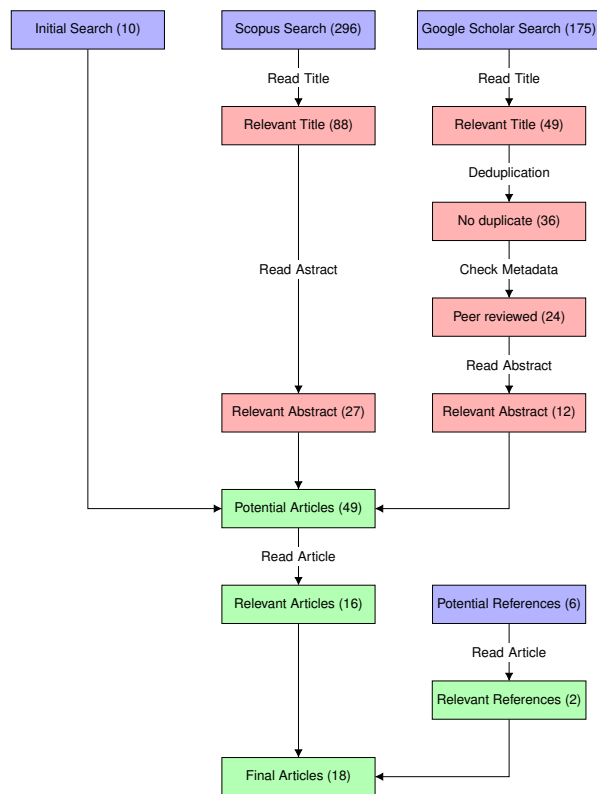
Figure 1. Process of the systematic literature review

to gain familiarity with the literature on collaborative work, data engineering, and open data over a variety of academic search engines. We included articles that were potentially relevant to the research question from these results. Based on the knowledge gained from the pilot study, we defined a systematic search strategy. We retrieved literature from Google Scholar and Scopus to cover a wide range of publications.