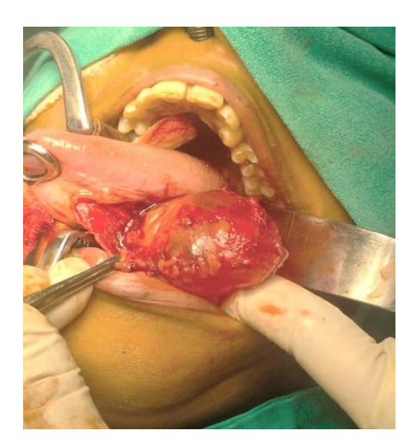
Figure 2: Intra-operative picture showing complete excision of the ranula.

topic, with conflict of evidence as to which modality is the ideal to the existing gap in knowledge on the present concept of its etiopathogenesis. There are several surgical techniques have been described for the treatment of oral and plunging ranulas, and the results have found that sublingual gland excision is associated with the lowest recurrence. There is a variety of surgical procedures have been mentioned in the medical literature from simple aspiration to complete or partial excision of the ranula (Figure 2) and/or sublingual salivary gland. These include marsupialization, dissection, sclerotherapy, cryotherapy, hydro-dissection, and light amplification by stimulated emission of radiation (LASER) ablation.<sup>37</sup> The sclerotherapy uses bleomycin, an antineoplastic antibiotic Streptomyces verticillus-OK-432 (Picibanil), a of lyophilized mixture of a low virulent strain of Streptococcus pyogenes incubated with benzyl penicillin, that has been seen to produce a good effect.<sup>38</sup> Incision of the ipsilateral sublingual gland 'marsupialization' or simple excision of the cystic mass of the ranula is recommended for the treatment of simple ranulas. Alternatively, the ranula can be treated with the placement of a silk suture or seton into the dome of the cyst.<sup>39</sup>