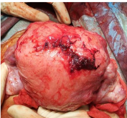
Figure 2: Uterus following repair of fundal rupture site.